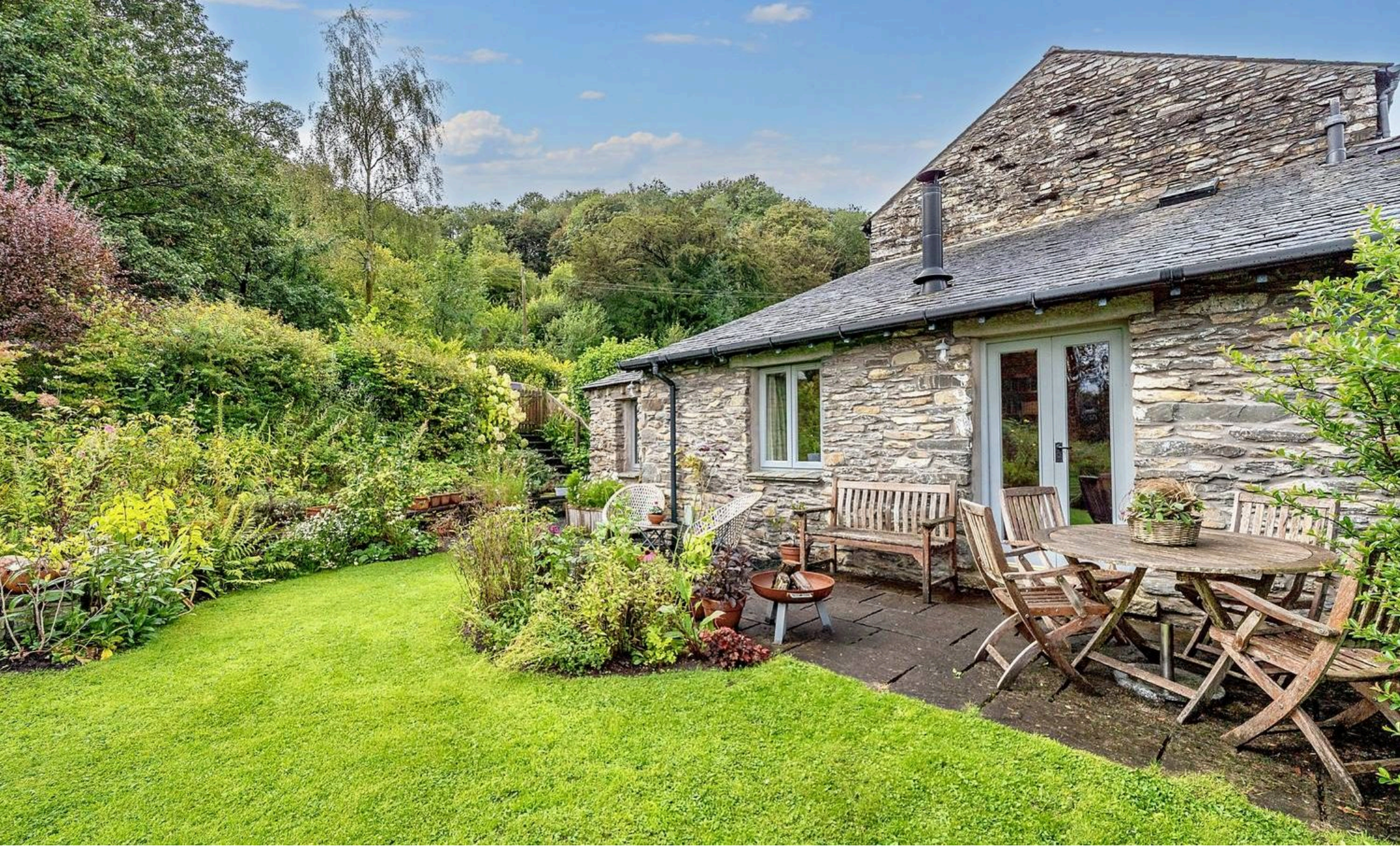
2 The Byres, Cartmel Fell £525,000