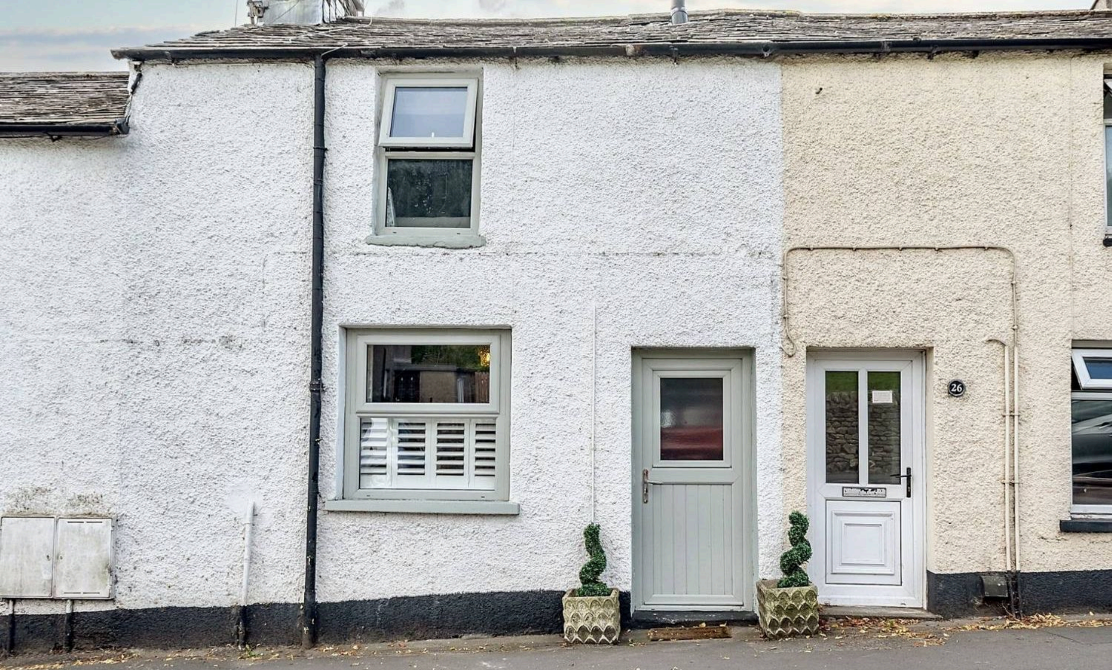
28 Long Lane, Sedbergh £200,000