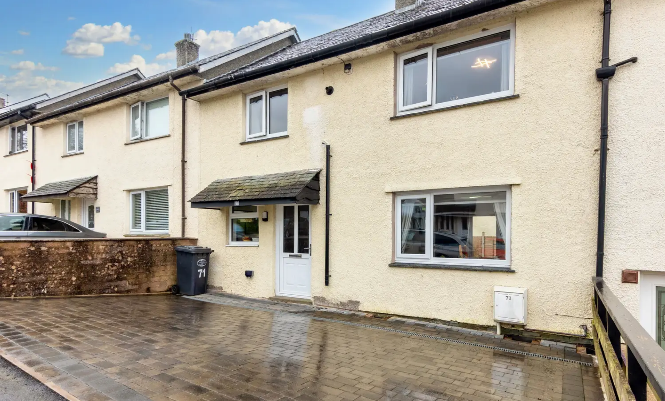
71 Claife Avenue, Windermere £300,000