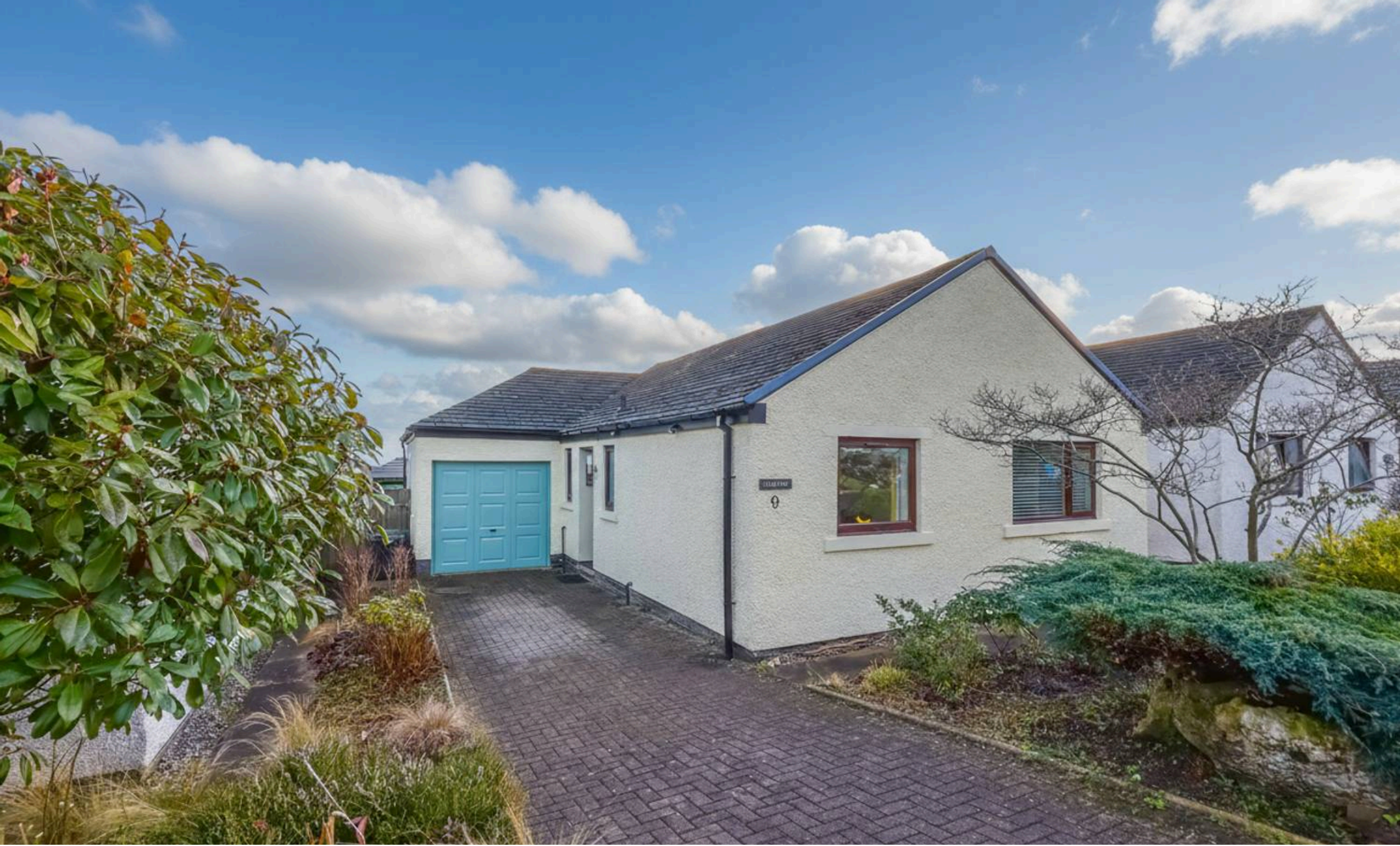
9 Ashmount Gardens, Grange-Over-Sands £325,000