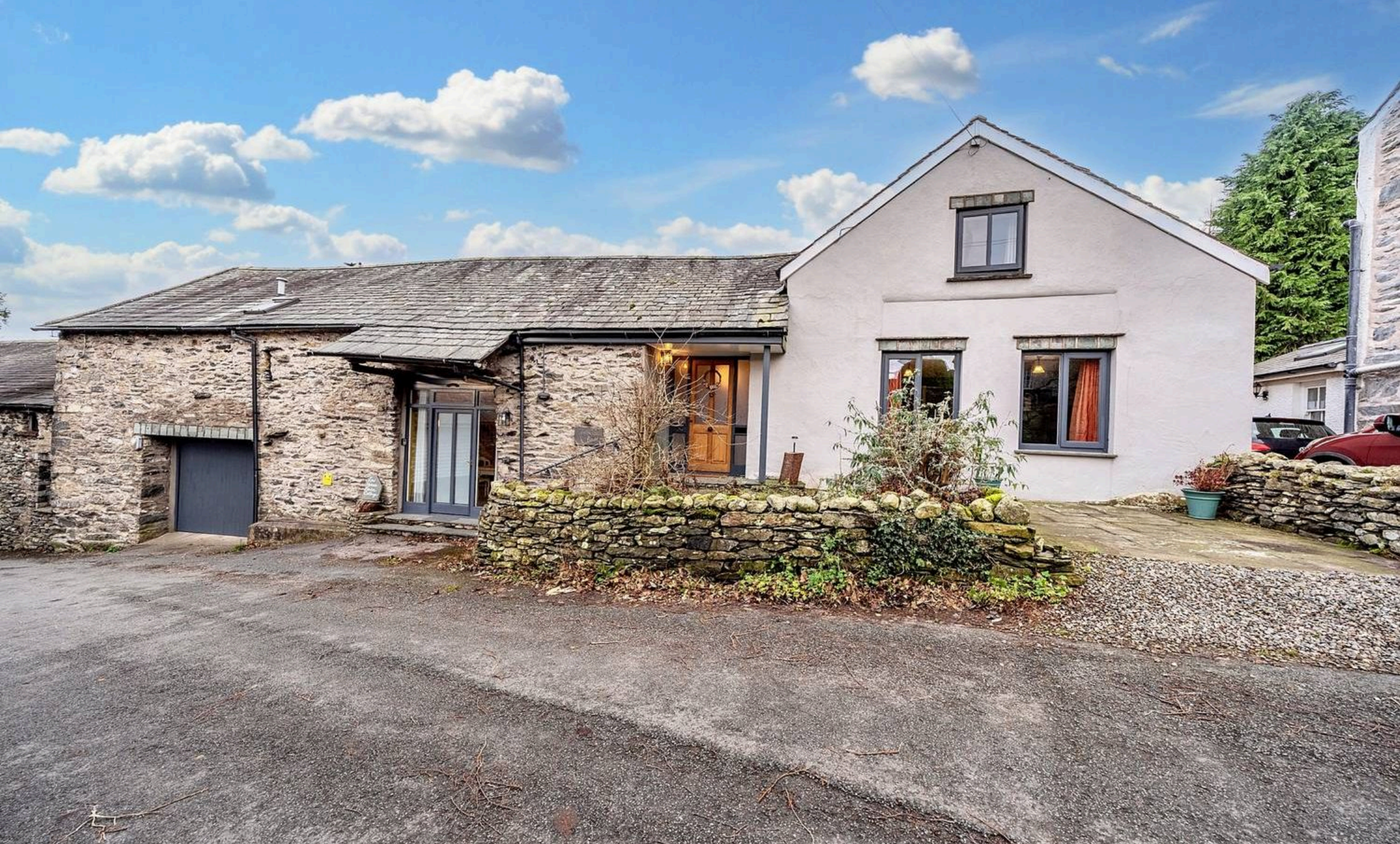
Low House Barn, Ayside £700,000