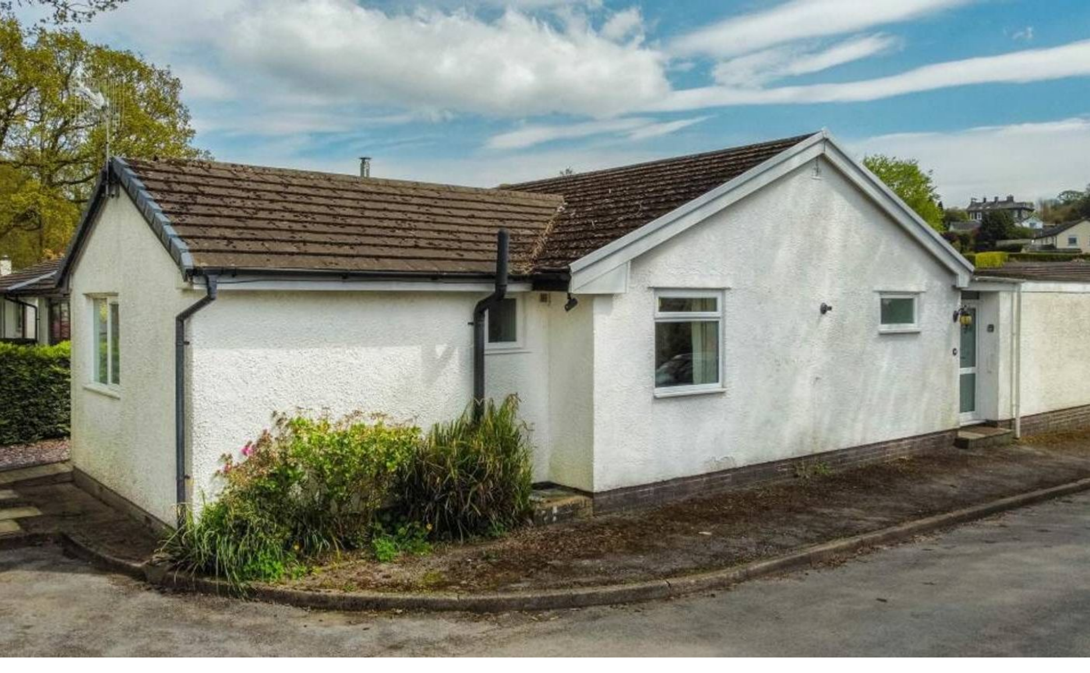
14 North Craig, Windermere £468,000