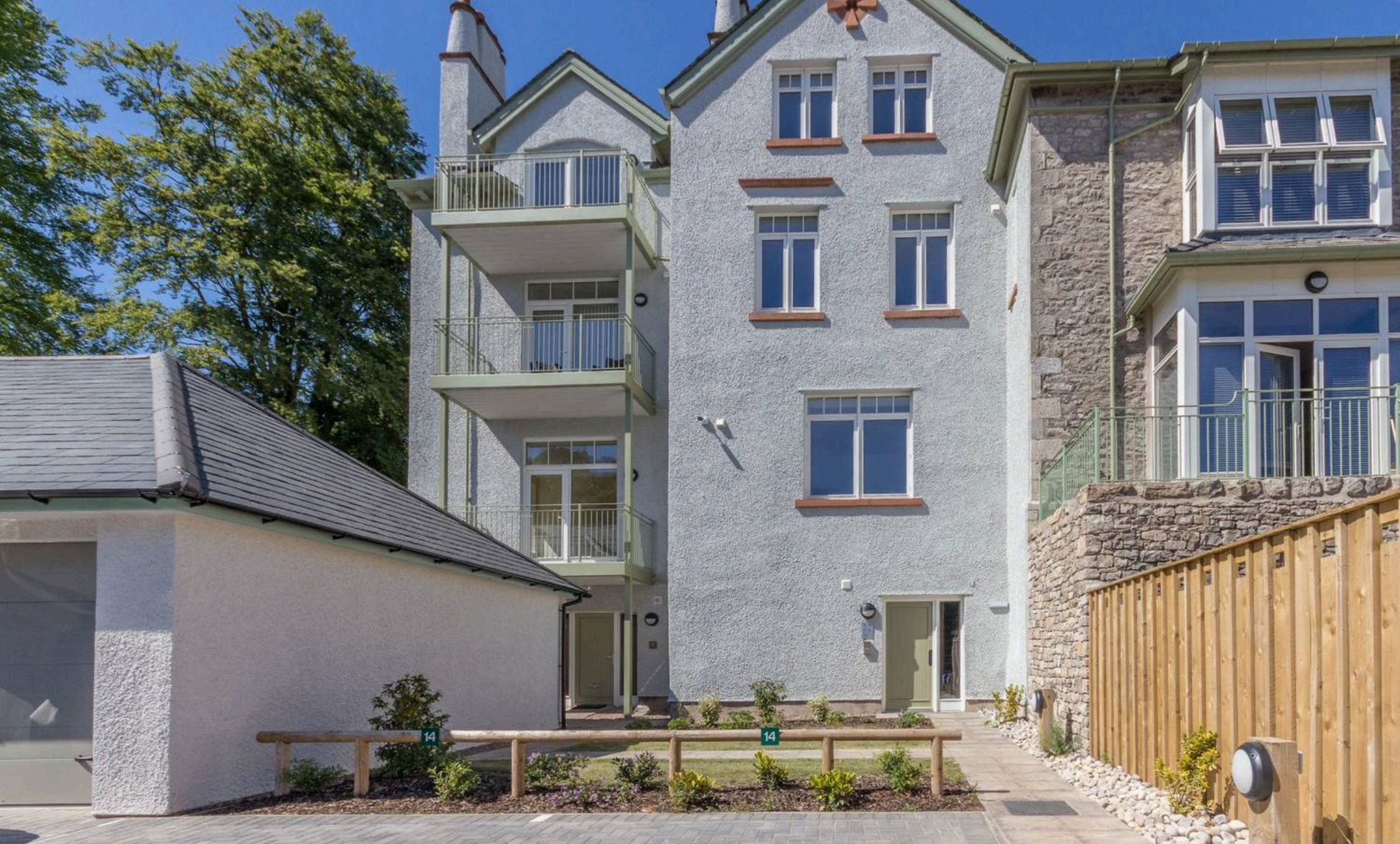
15 Tenterfield Brigsteer Road, Kendal £200,000