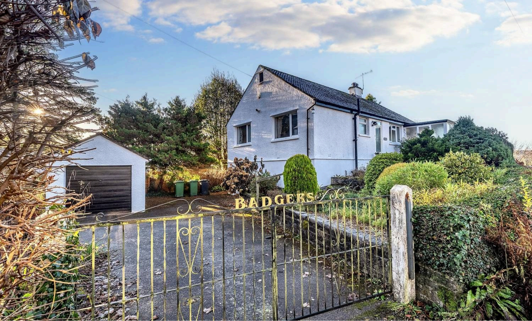
1 Crow Wood, Brigsteer £400,000