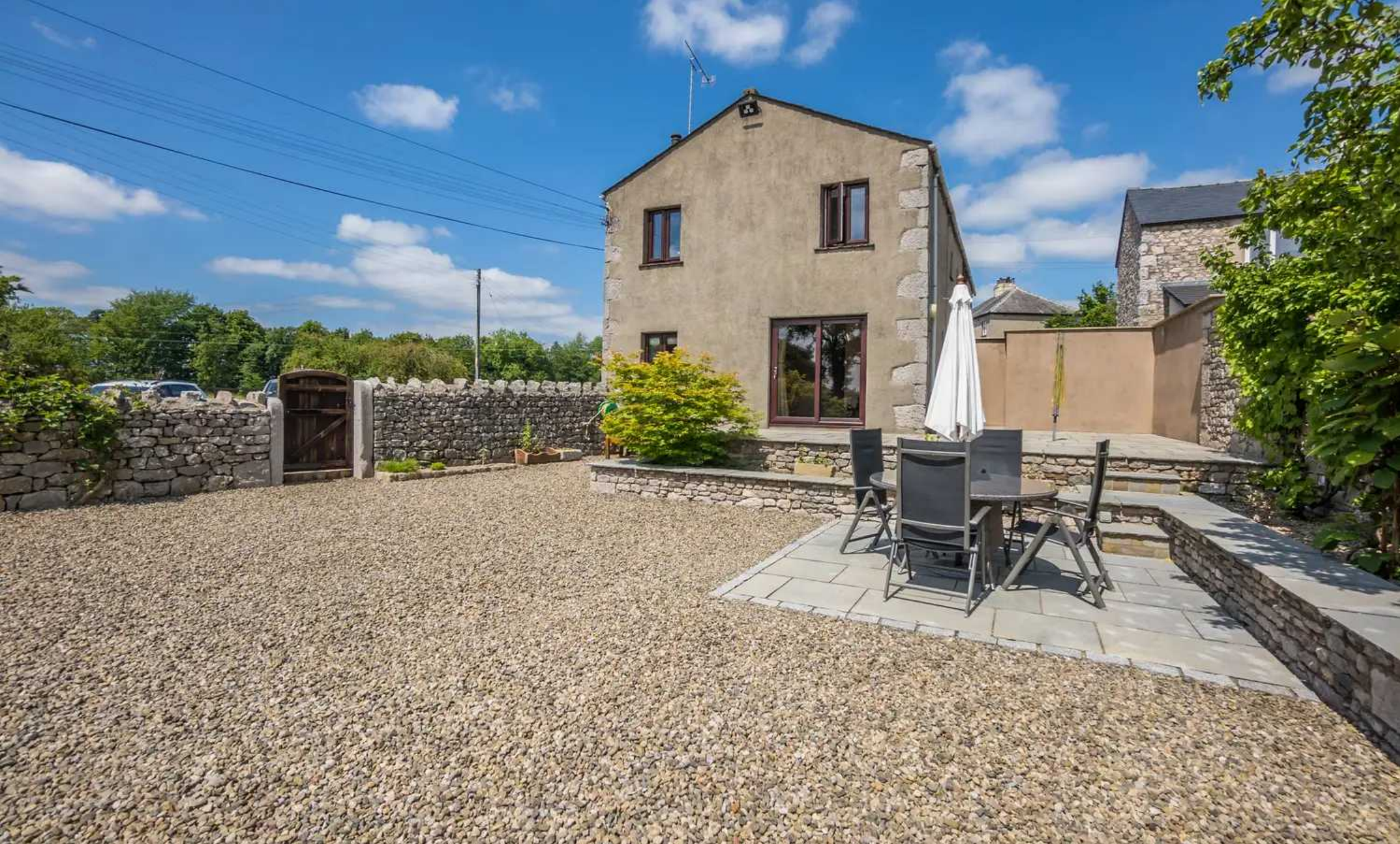
Rose Cottage Carr Bank Road, Carr Bank £545,000 Freehold