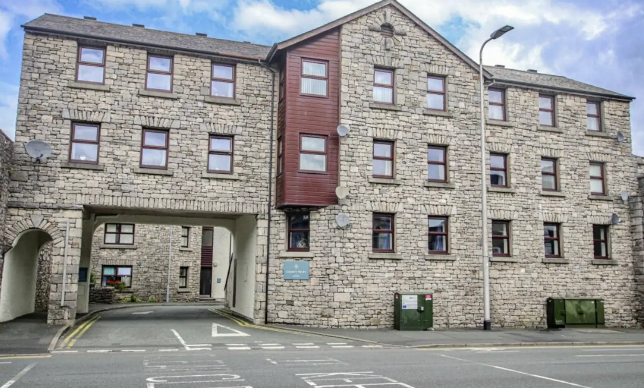
Flat 2, County Mews Sandes Avenue, Kendal