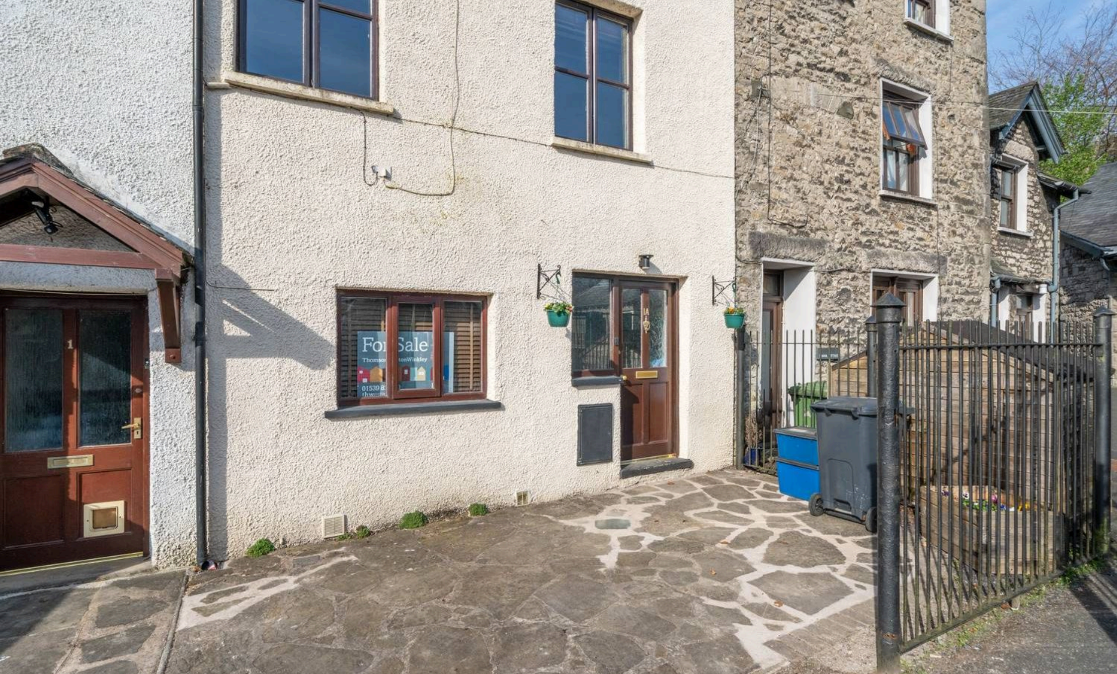
1a Stramongate Hall Cottage, Yard 56 Stramongate £199,950