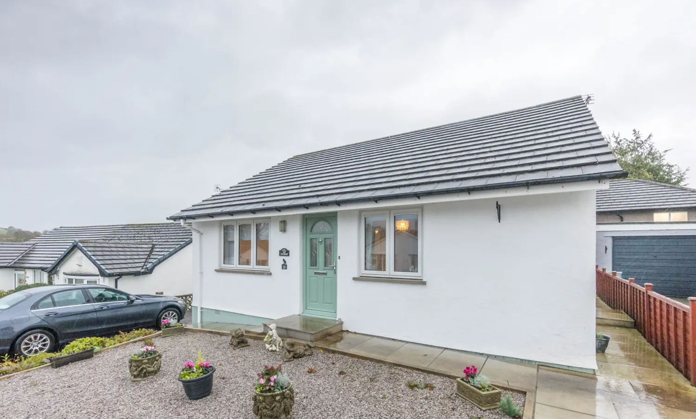
1b Fairfield, Flookburgh £270,000