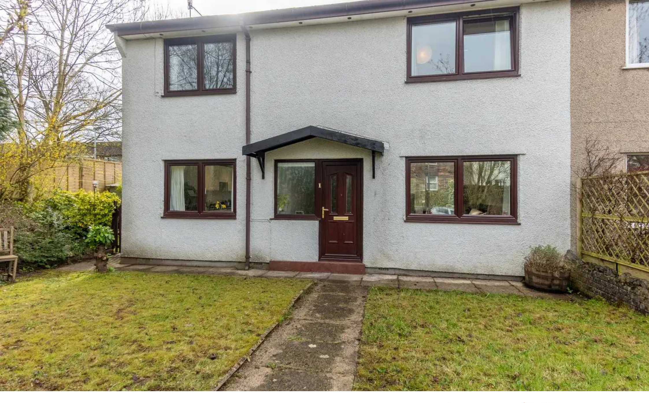
1 Hall Park, Burneside £250,000