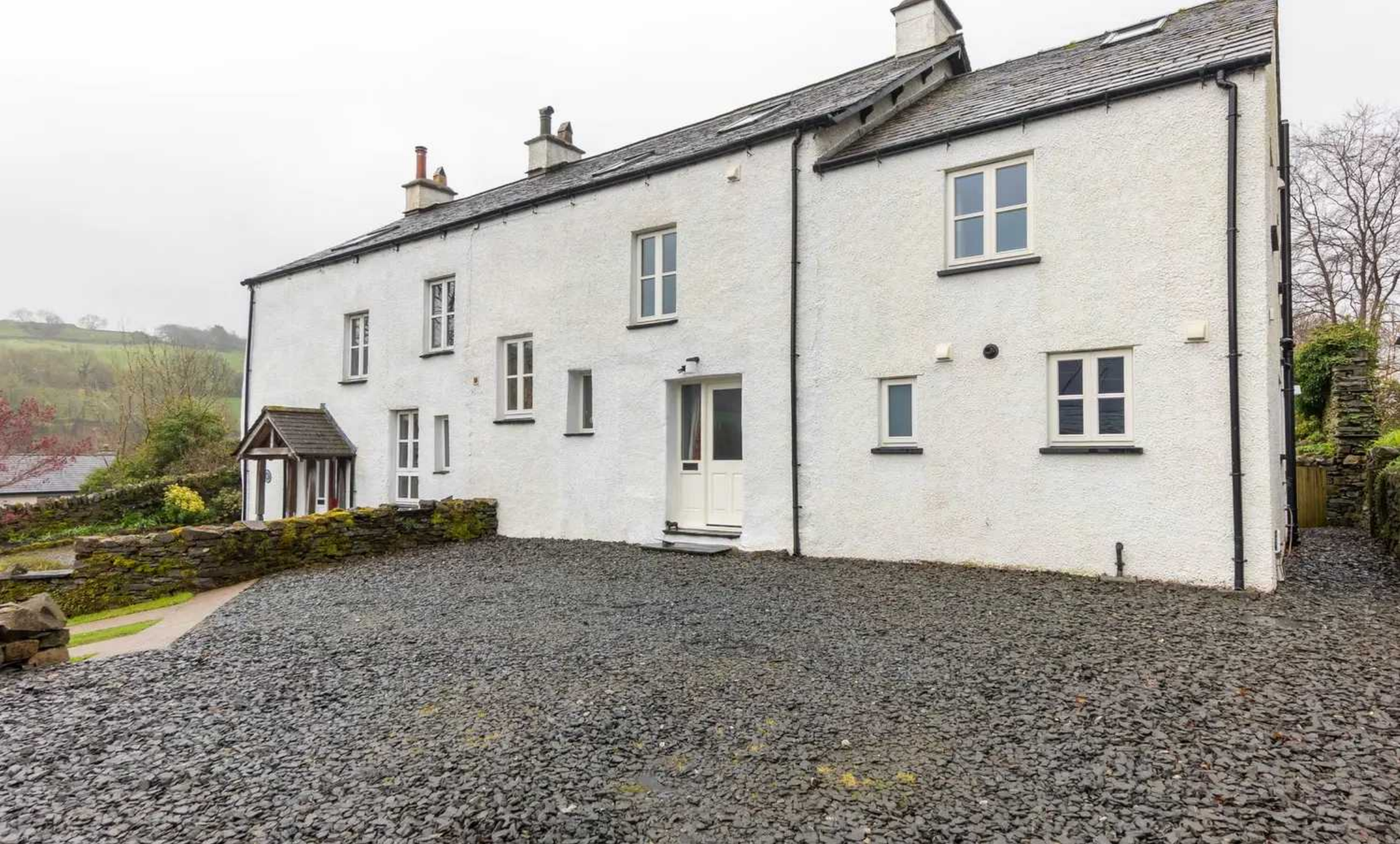
2 Park House Cottages, Backbarrow £550,000