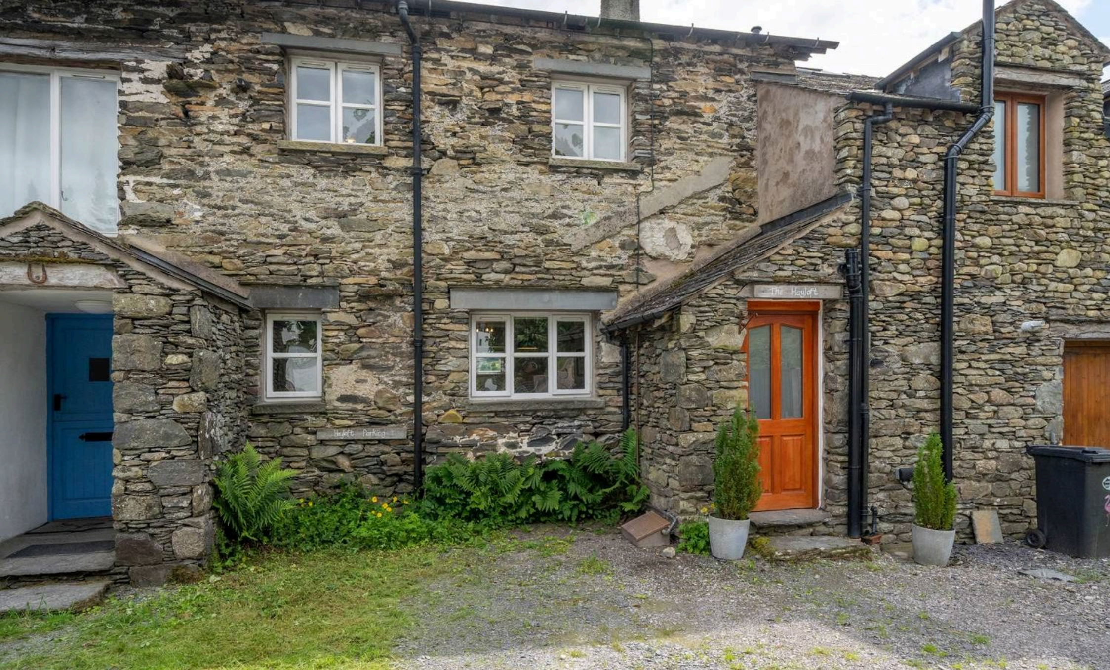
Gilthroton Hayloft, Burneside £425,000