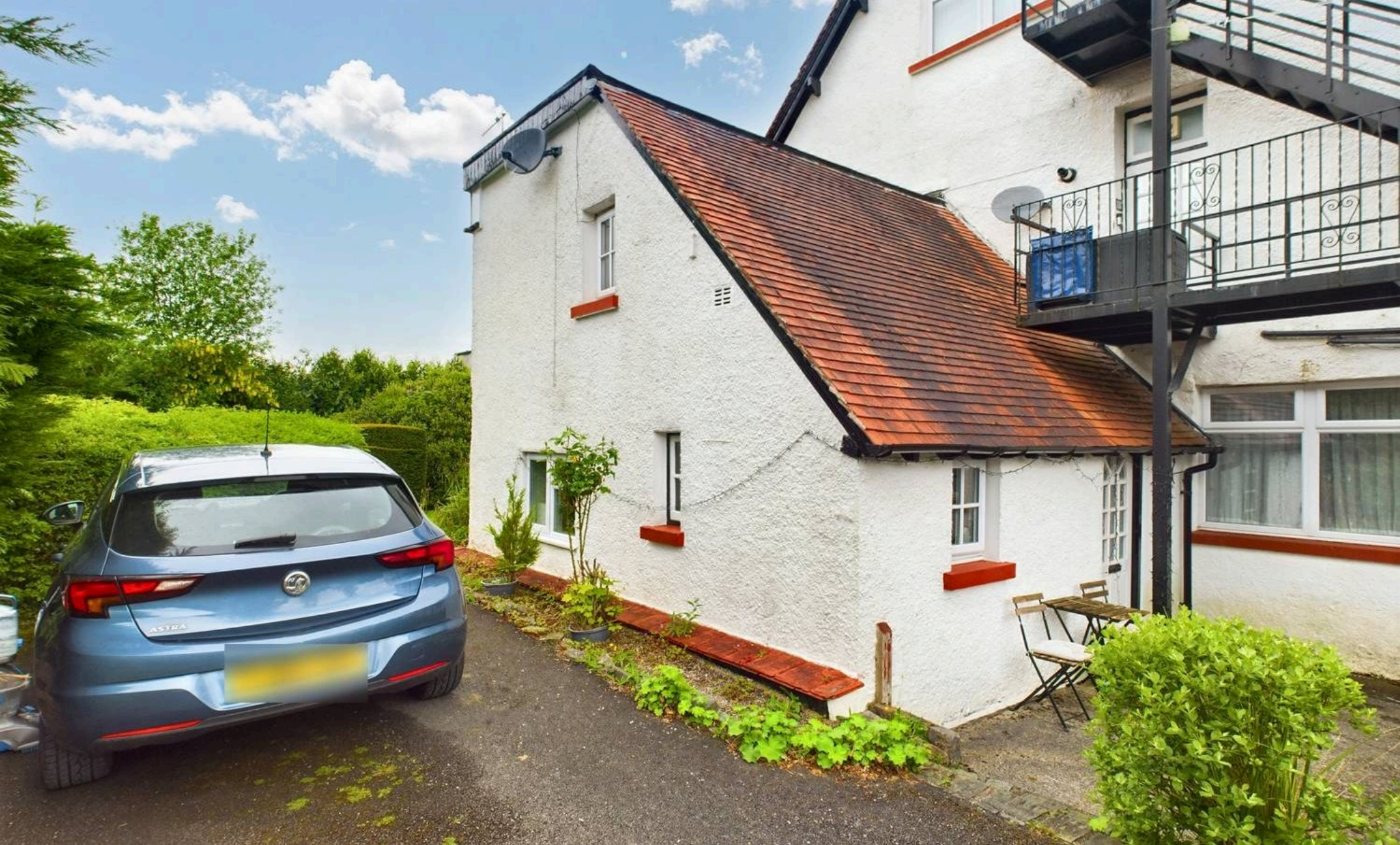
7 Rotherwood Thornbarrow Road, Windermere £200,000