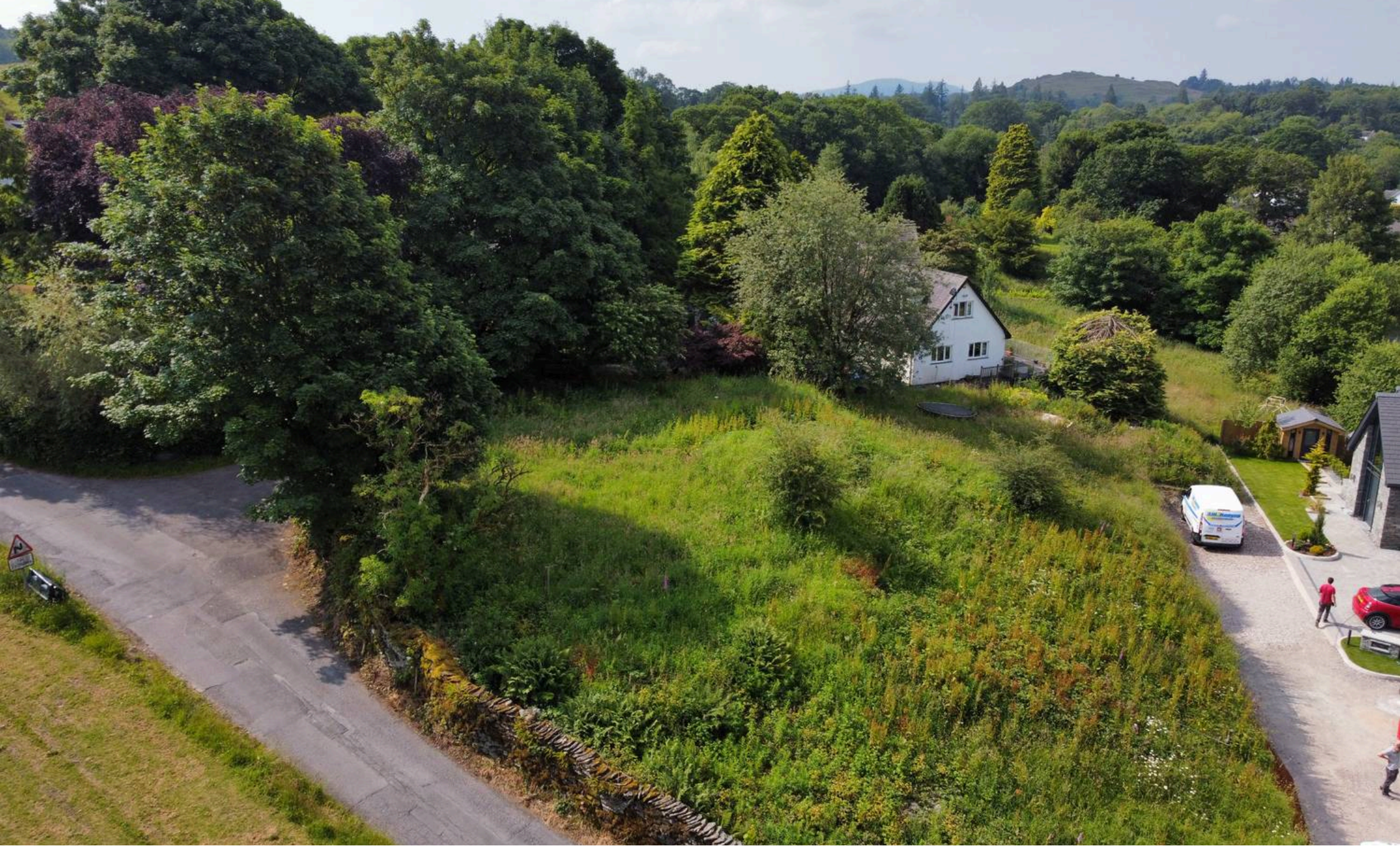
Plot 3, Lickbarrow Road, Windermere £350,000