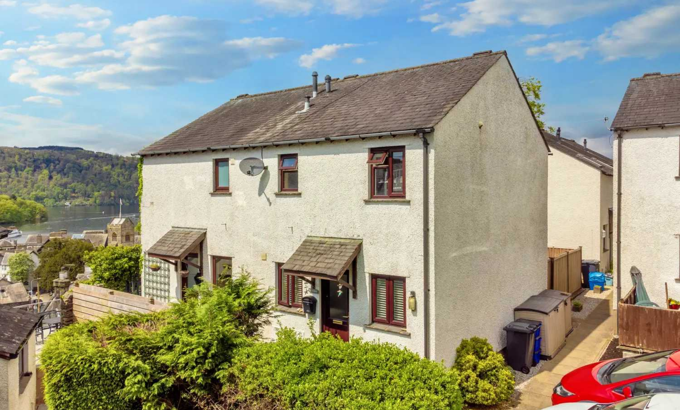
4 Belle Isle View, Bowness-On-Windermere £315,000