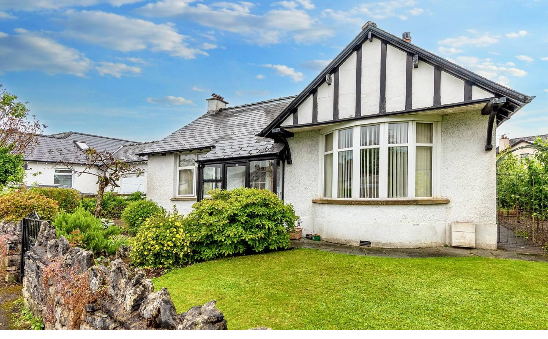
43 Heron Hill, Kendal £325,000