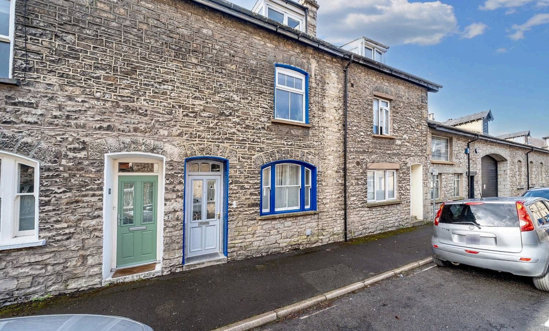
6 Queen Katherine Street, Kendal £230,000