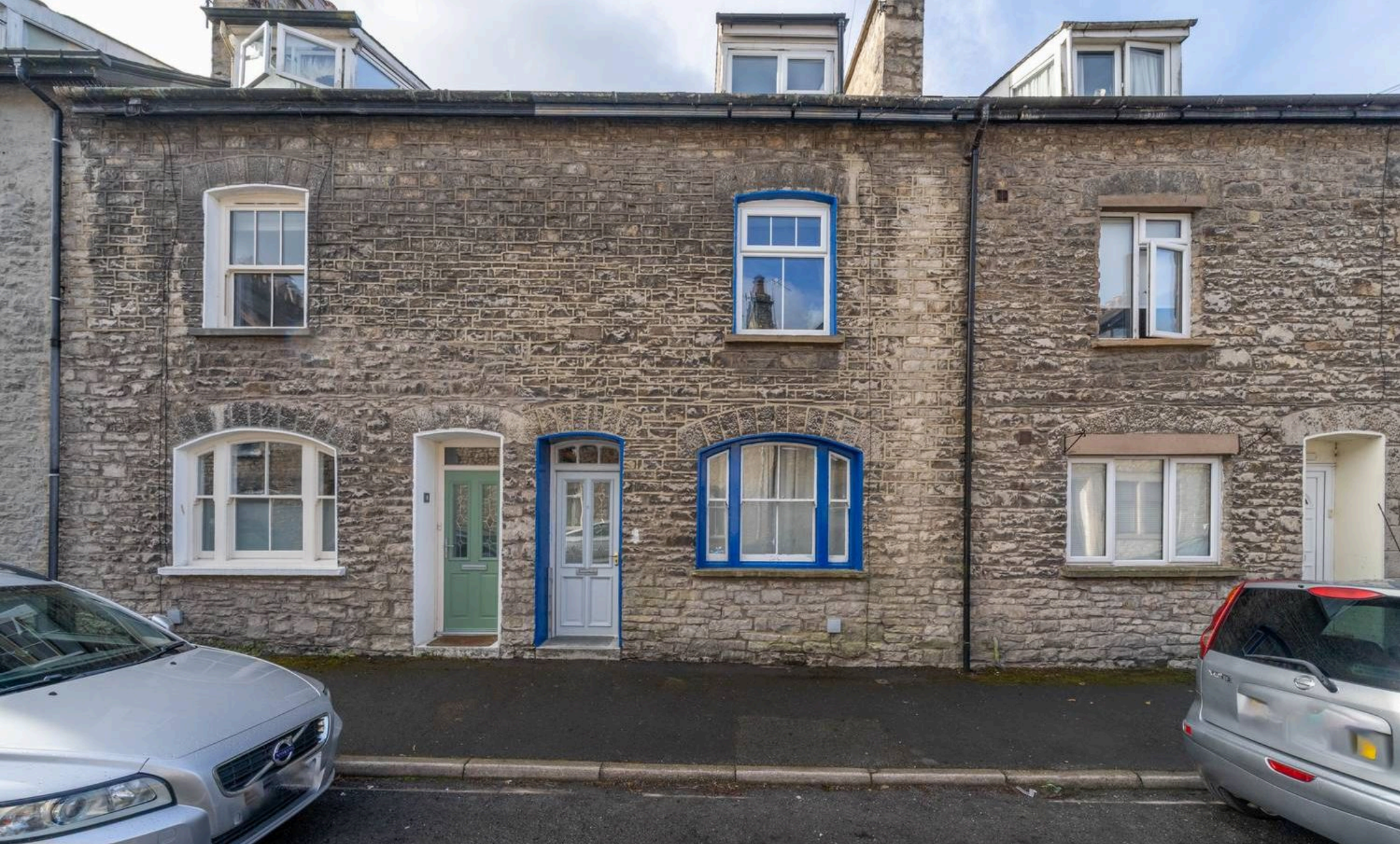
6 Queen Katherine Street, Kendal £250,000