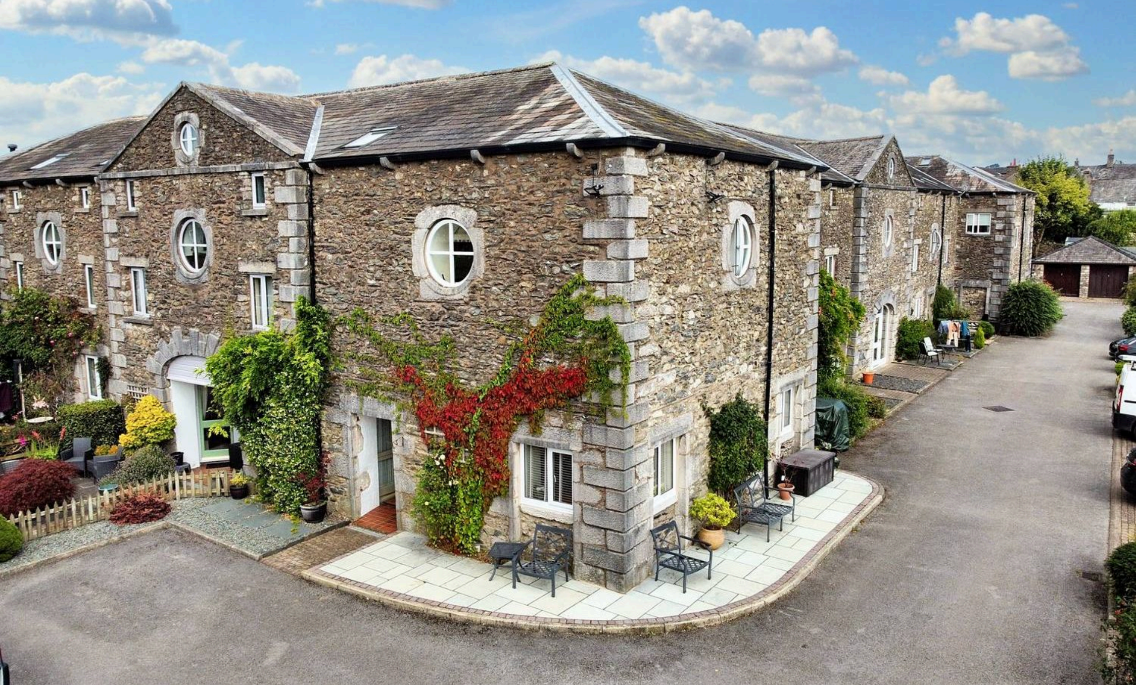
9 Stockdale Farm Moor Lane, Flookburgh £260,000