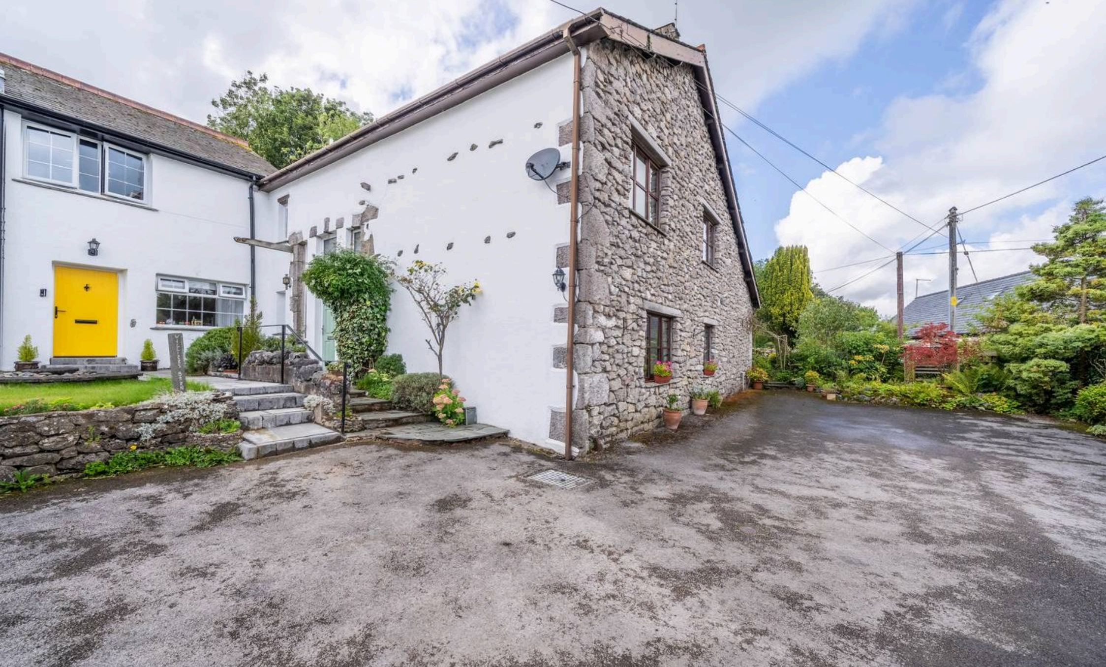
Hale Head House, Hale £550,000