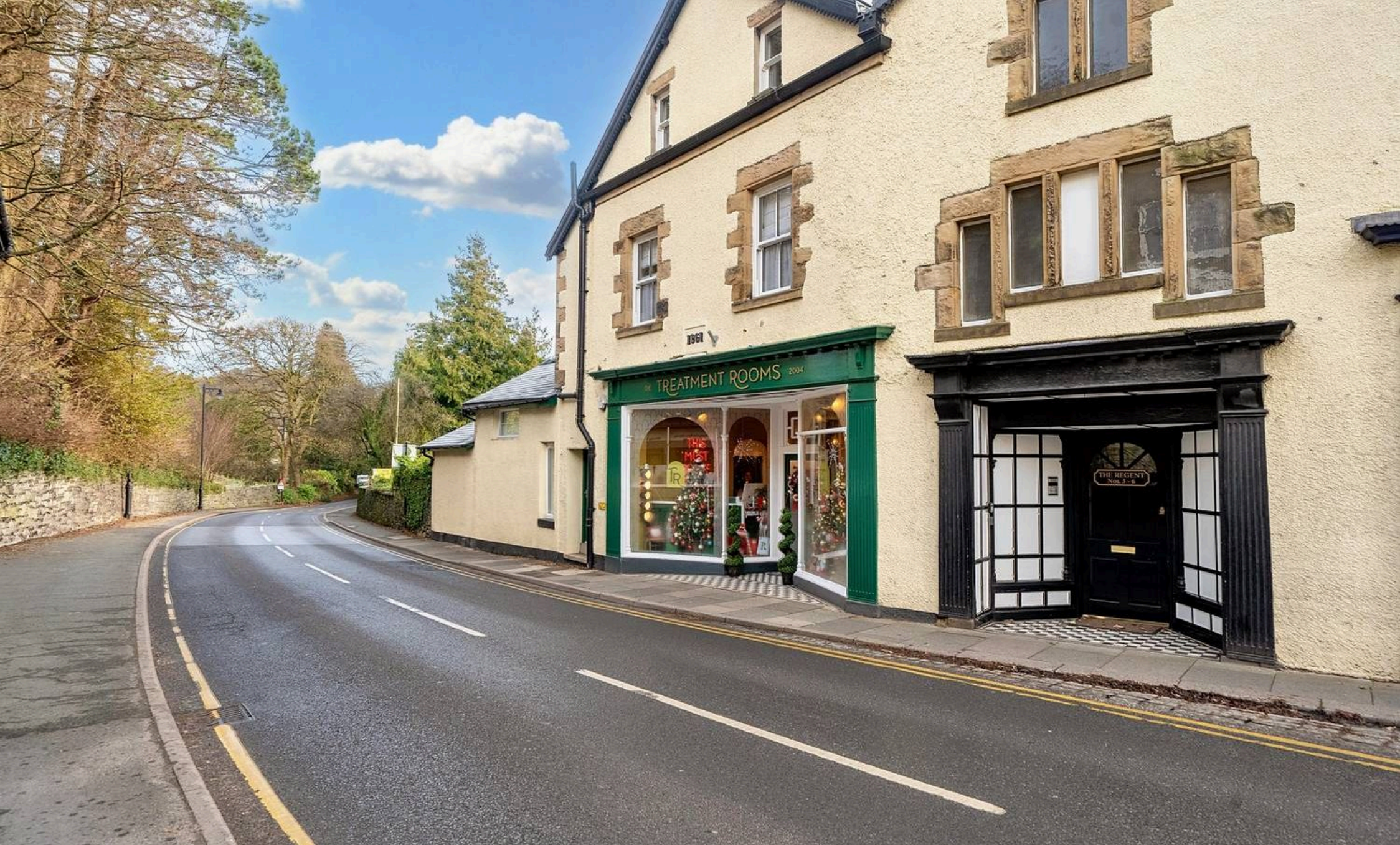
Flat 5, The Regent Main Street, Grange-Over-Sands £230,000