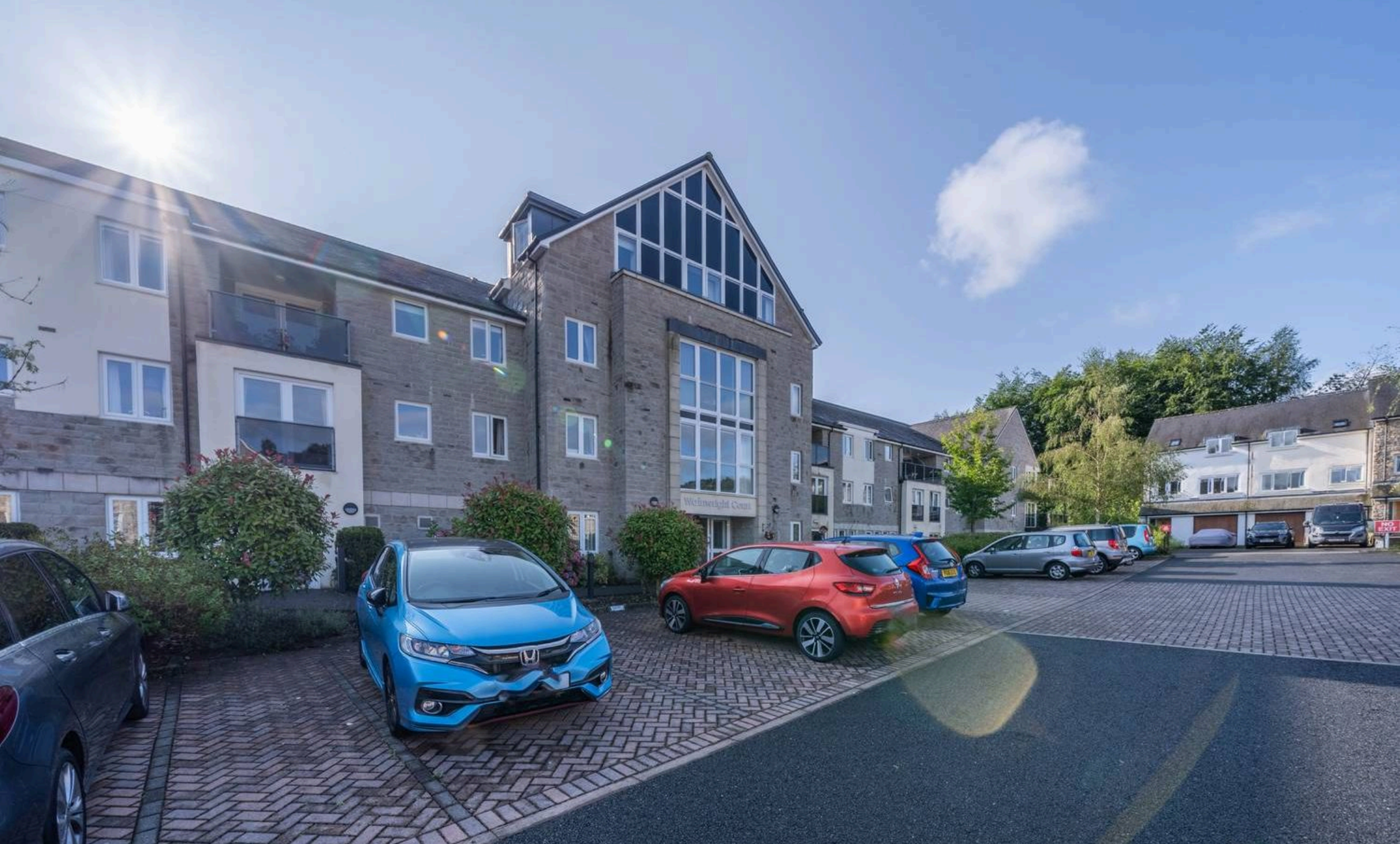
Apt 54, Wainwright Court Webb View, Kendal £180,000