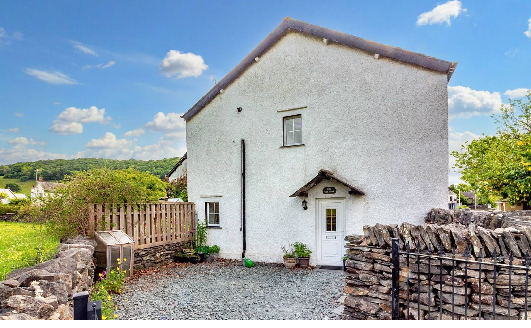
The Old Bank Windermere Road, Staveley £300,000