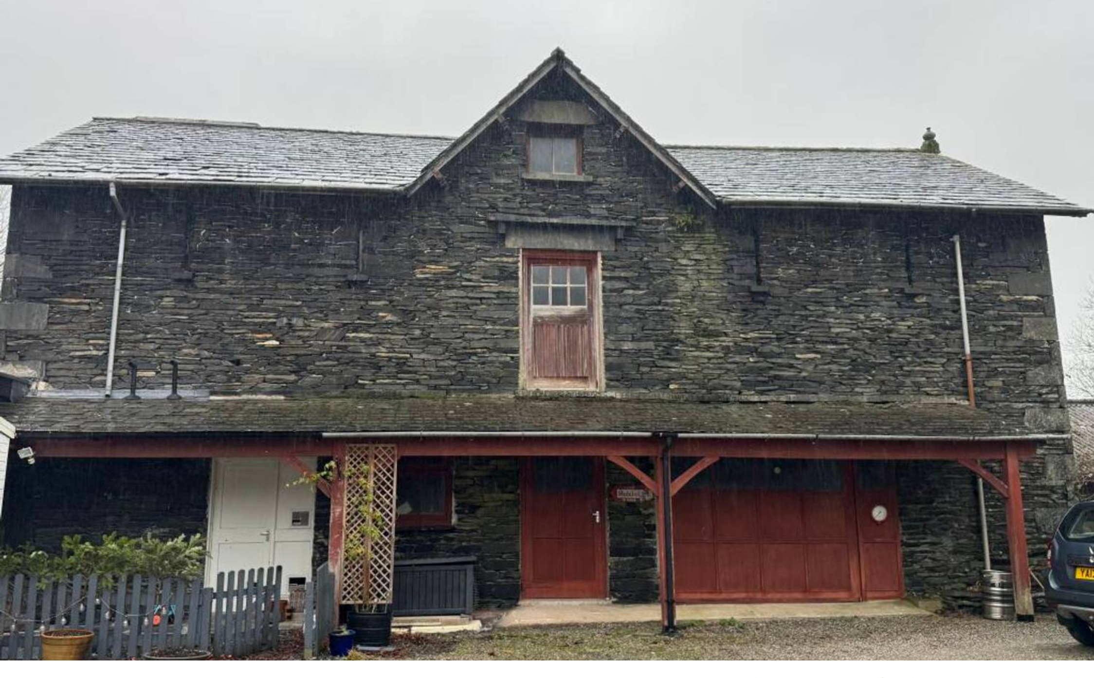
Waterhead Farm Barn, Coniston