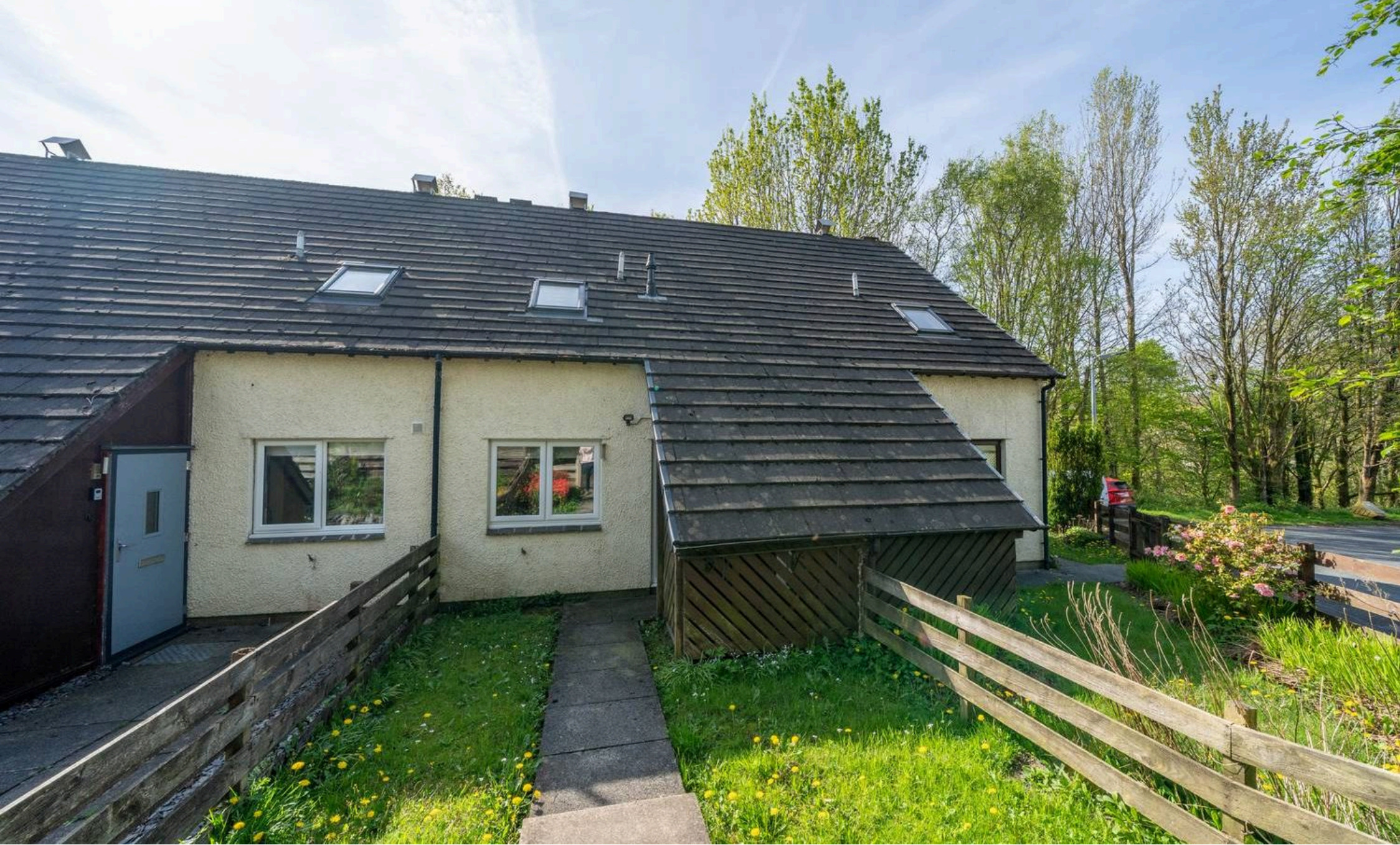
3 Droomer Lane, Windermere £215,000