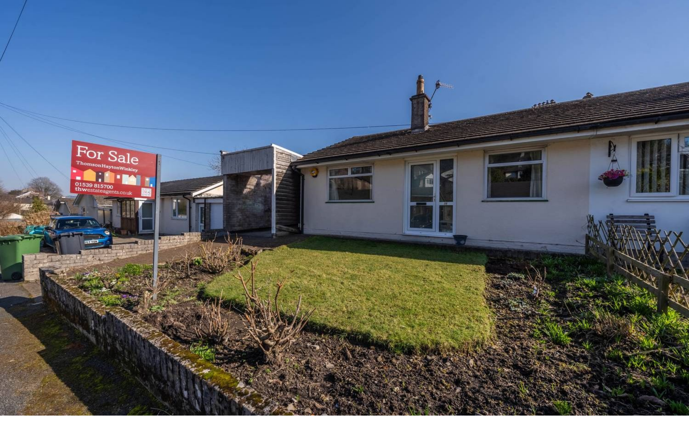
15 Ashleigh Road, Kendal £225,000