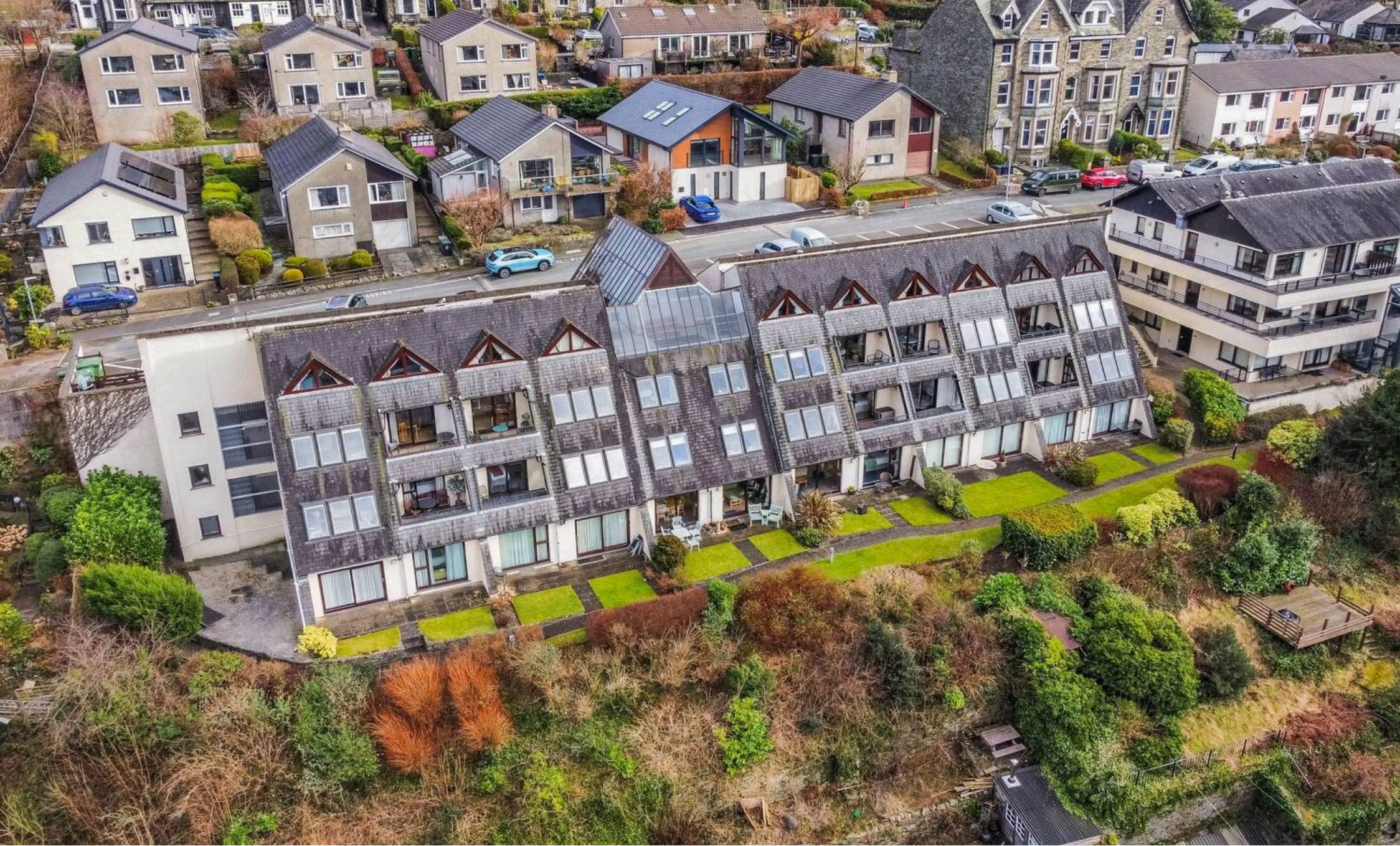
16 The Lakelands, Lower Gale, Ambleside £340,000