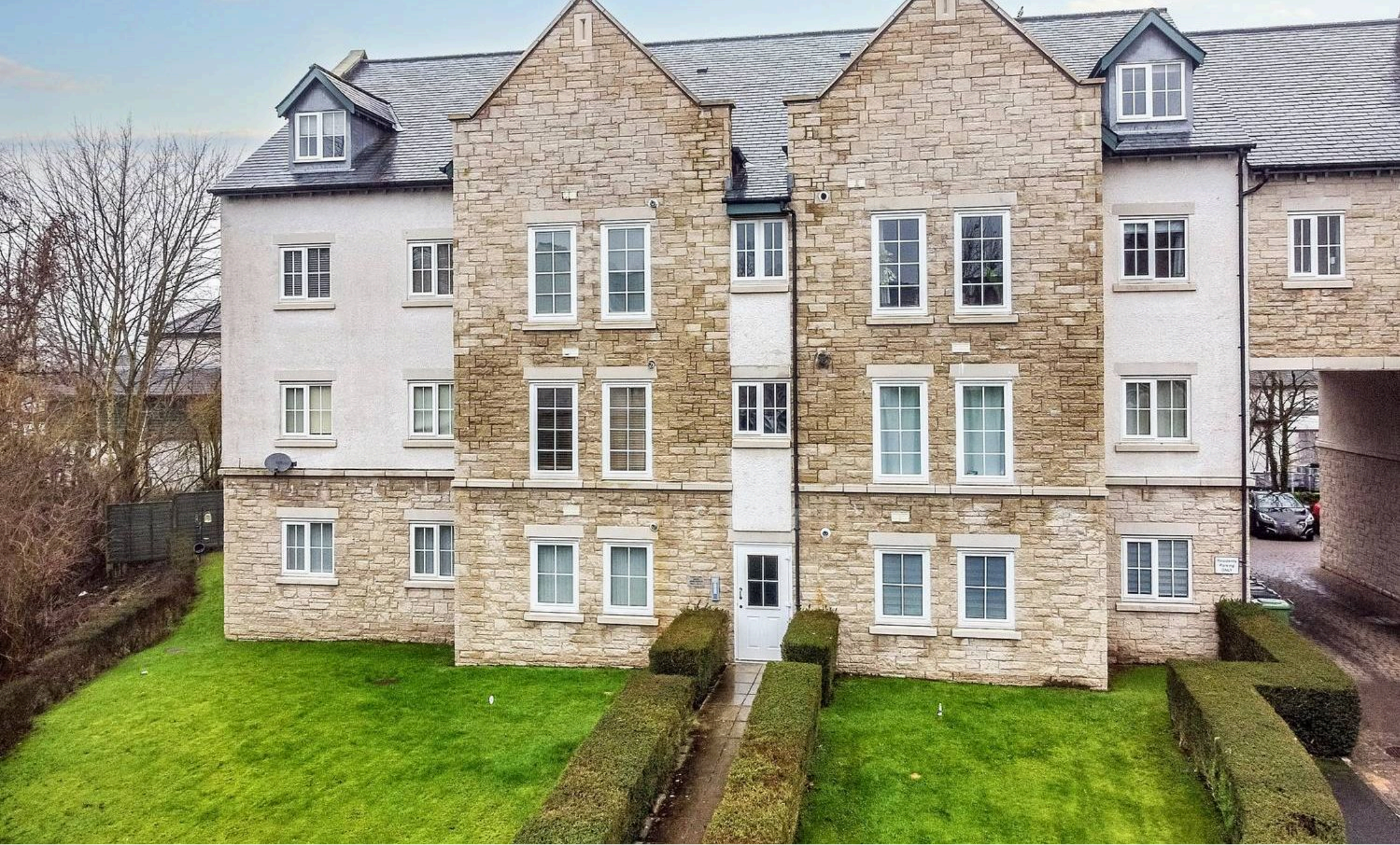
5 Kirkstone Mews, Kendal £118,000