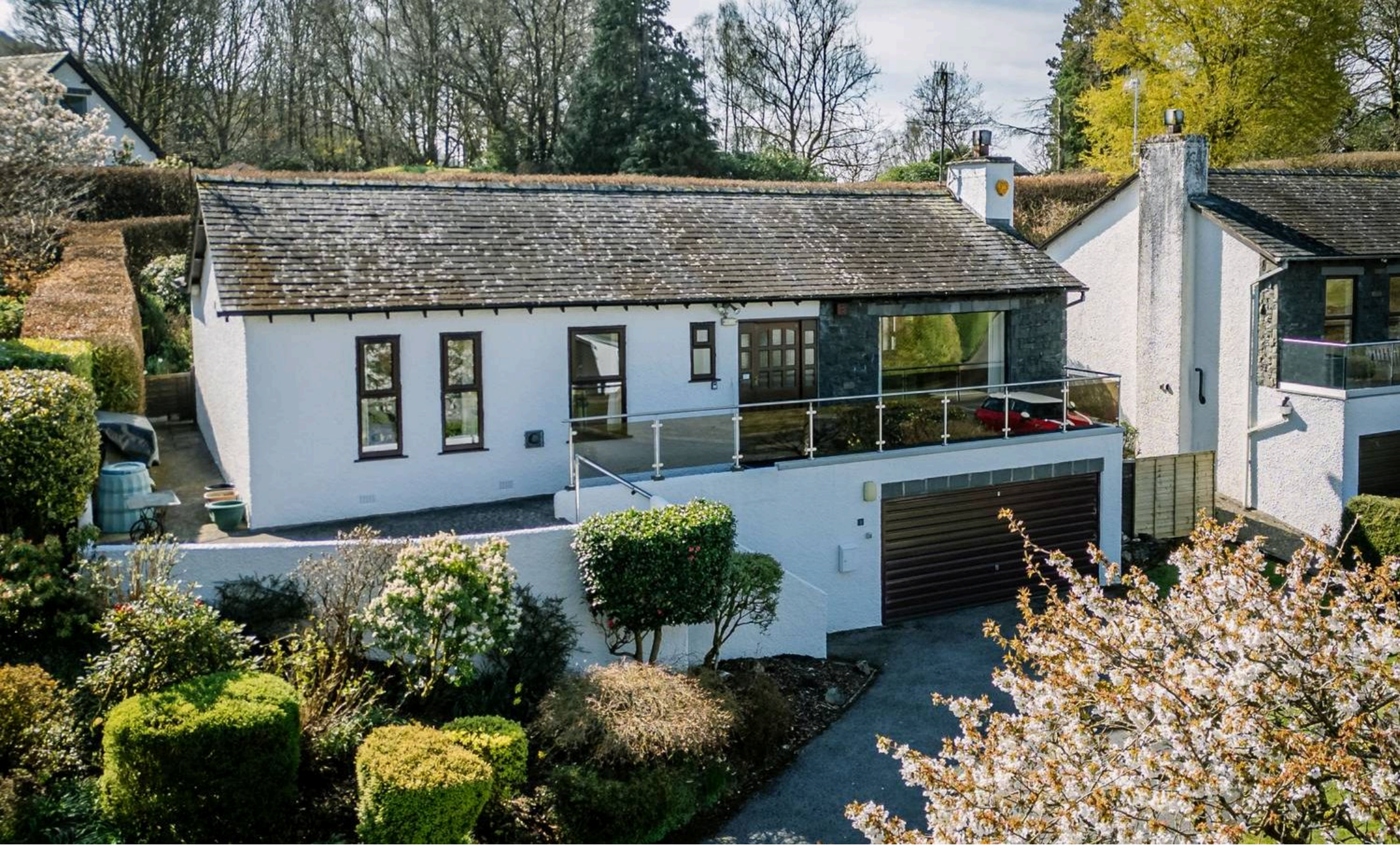
2 Ghyllside Stockghyll Lane, Ambleside £795,000