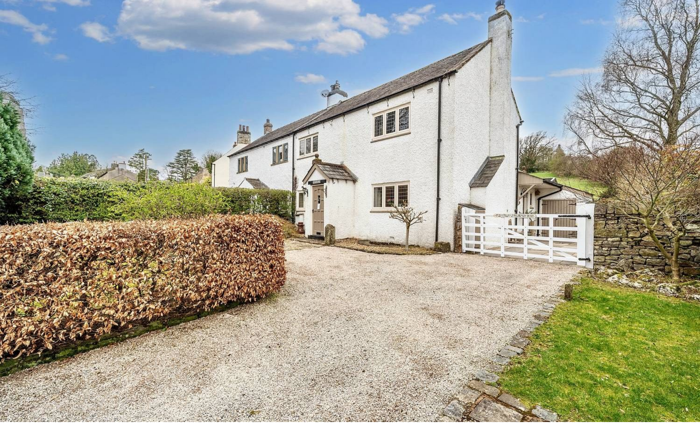
1 Braeside Church Street, Whittington £430,000