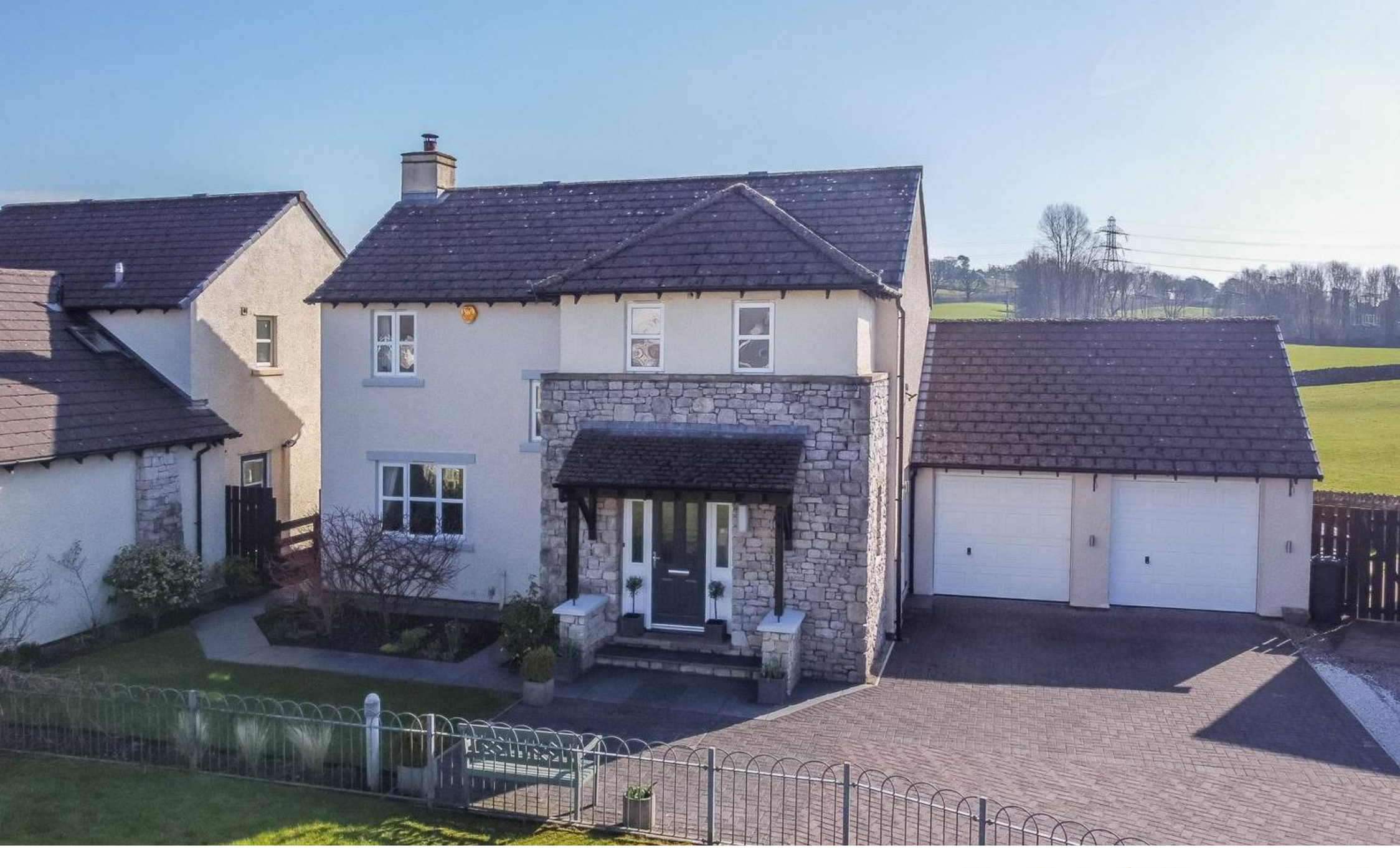
15 St. Marks Fold, Natland £650,000