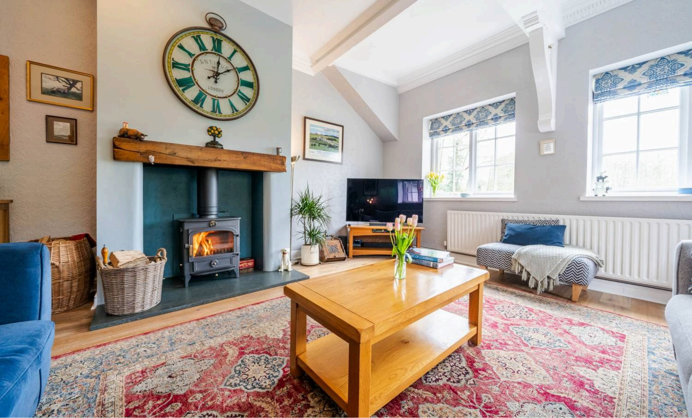
12 Starnthwaite Ghyll, Crosthwaite £345,000