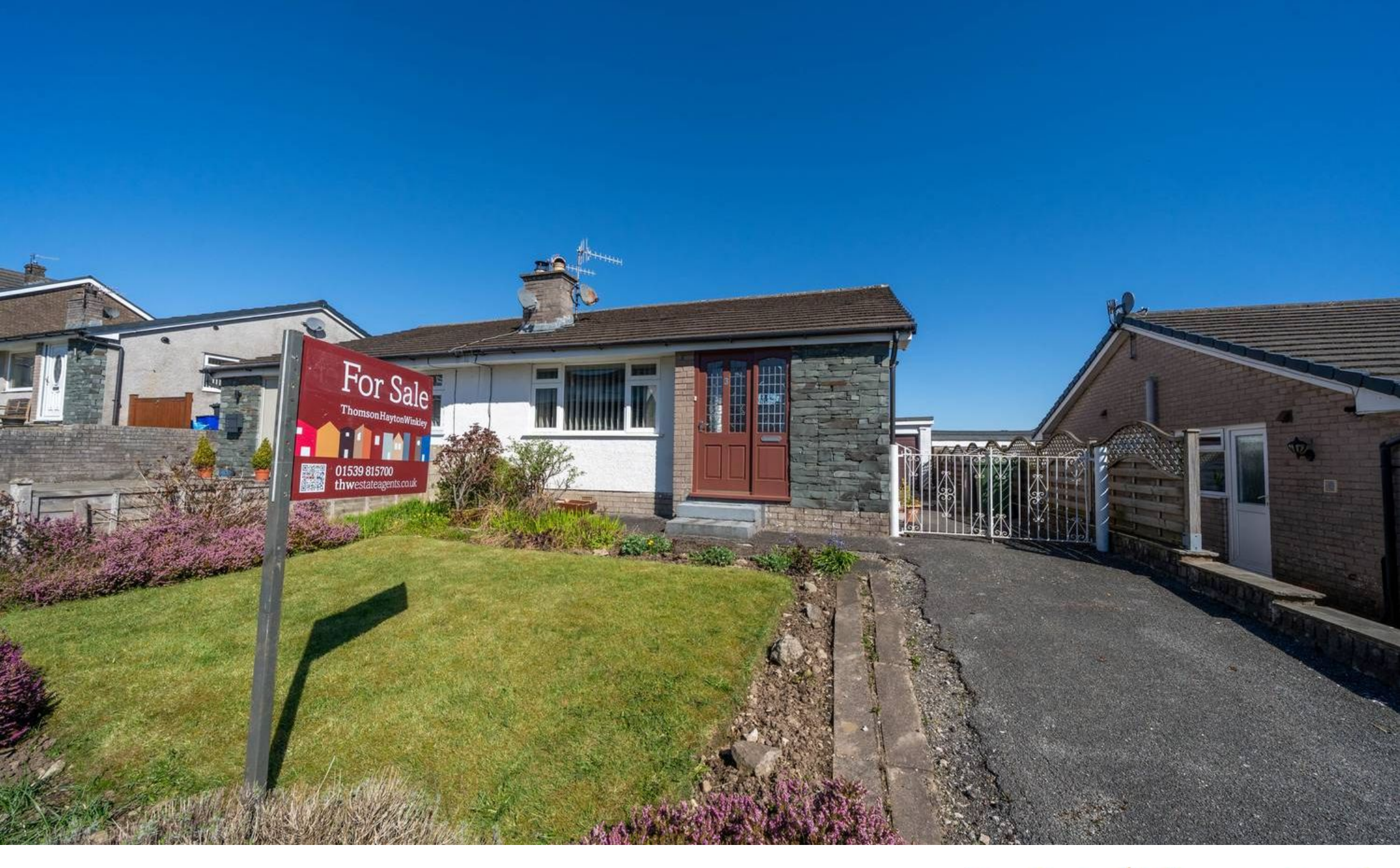
3 Kentwood Road, Kendal £270,000