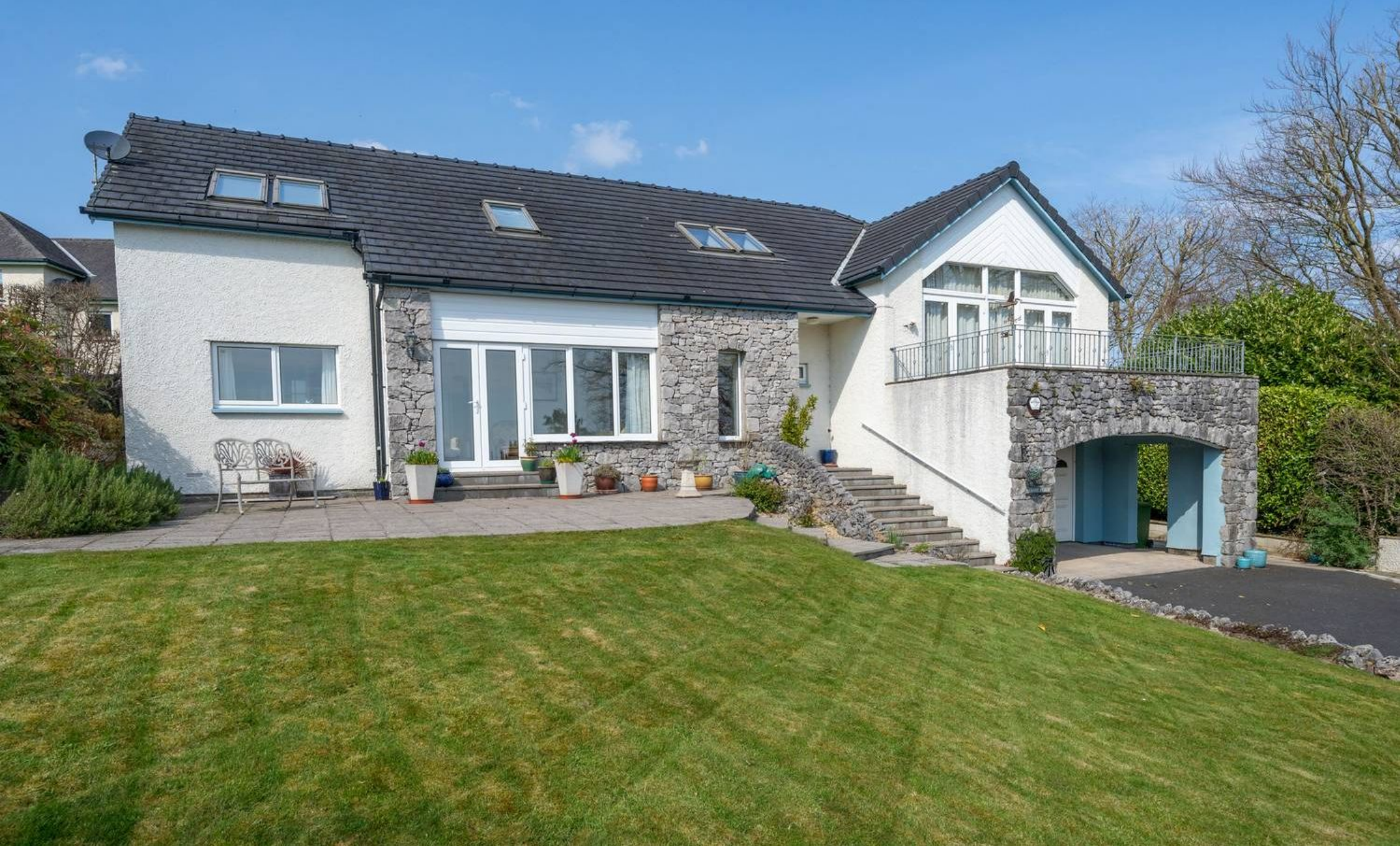
51 Carter Road, Grange-Over-Sands £700,000