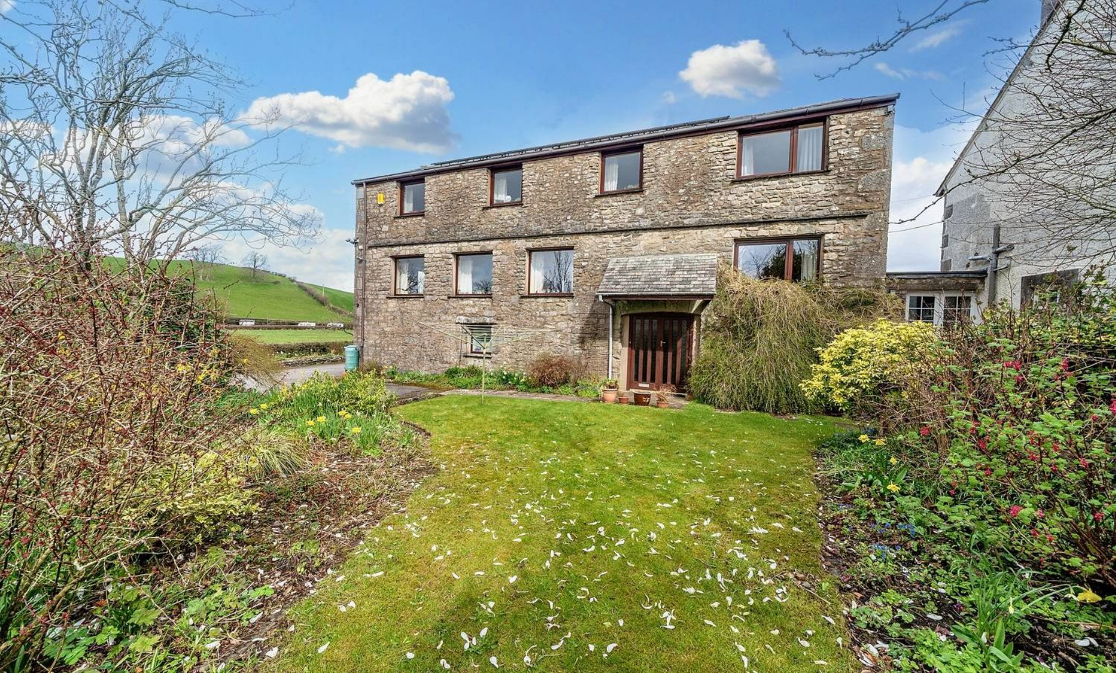
Kerine, Crooklands £750,000