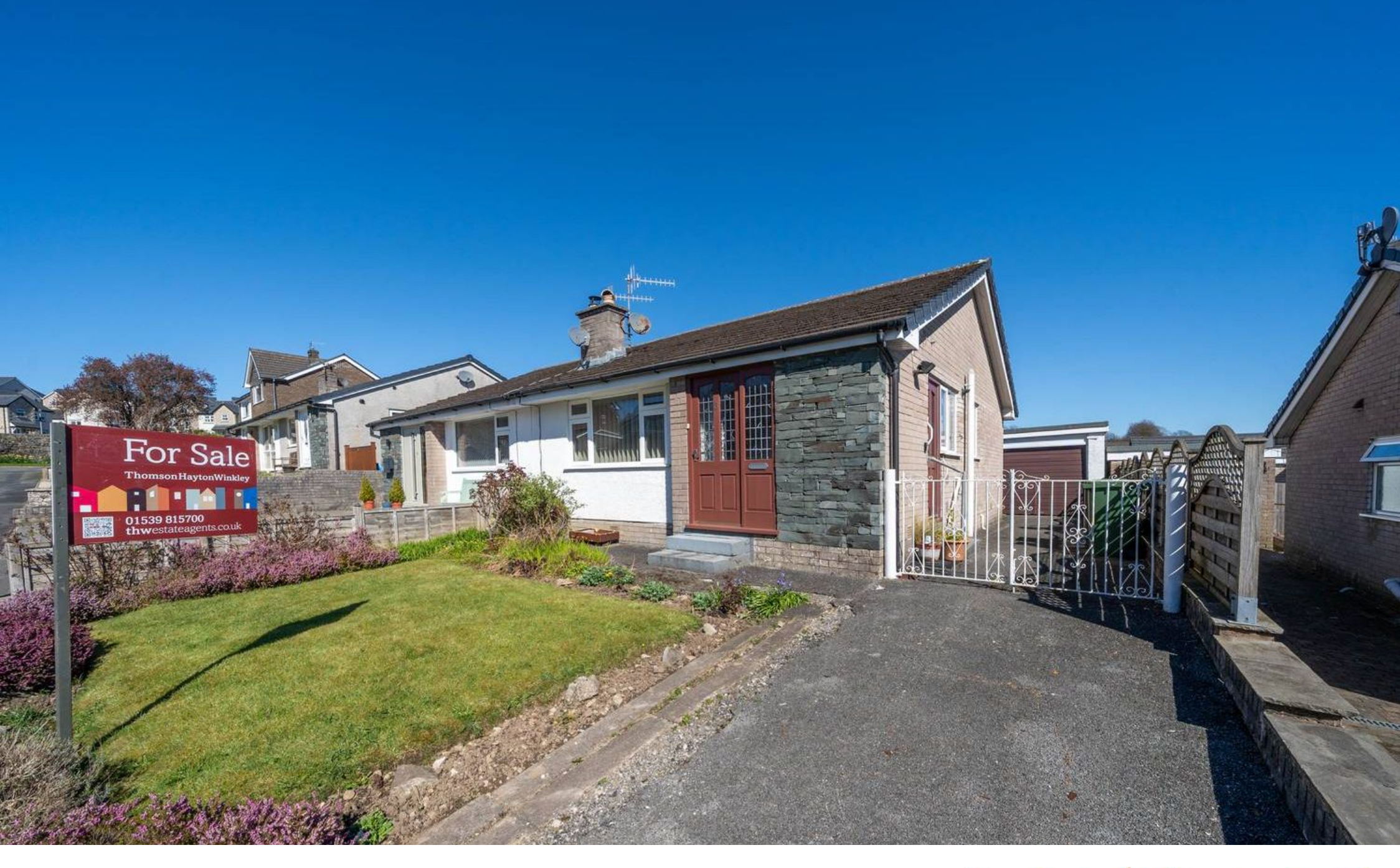
3 Kentwood Road, Kendal £300,000