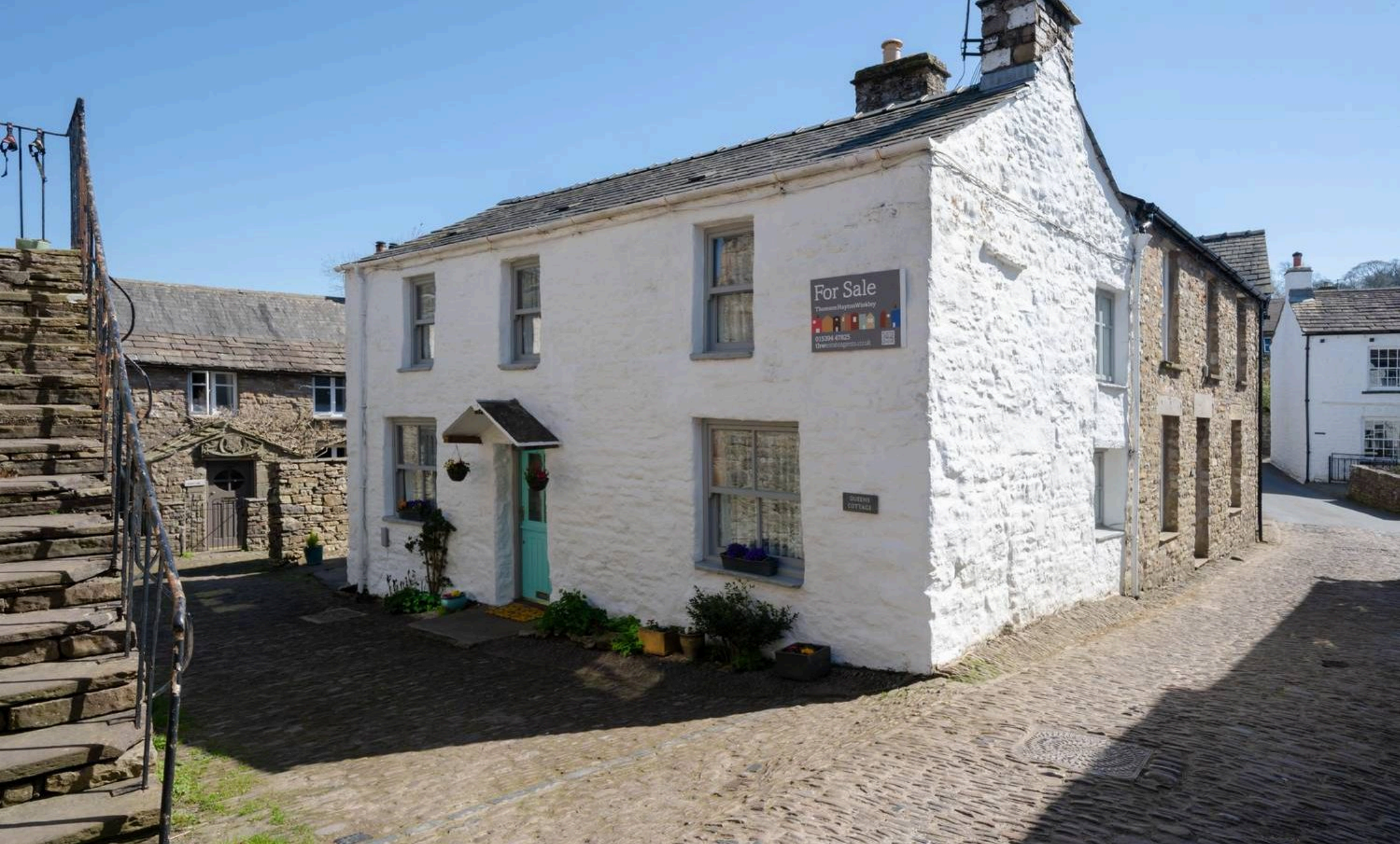
Queens Cottage Queens Square, Dent £285,000