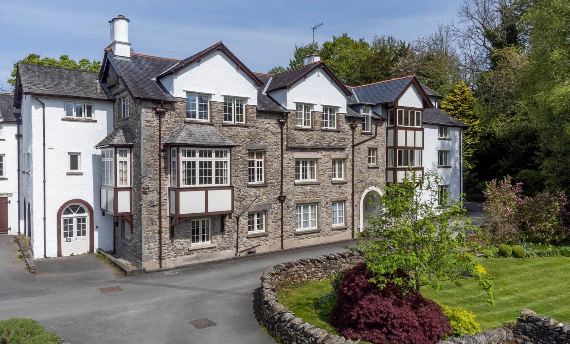
12 Starnthwaite Ghyll, Crosthwaite £360,000