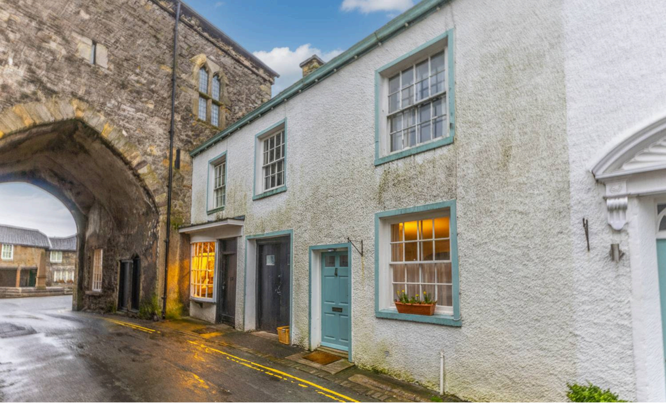
Tower Cottage Cavendish Street, Cartmel £375,000