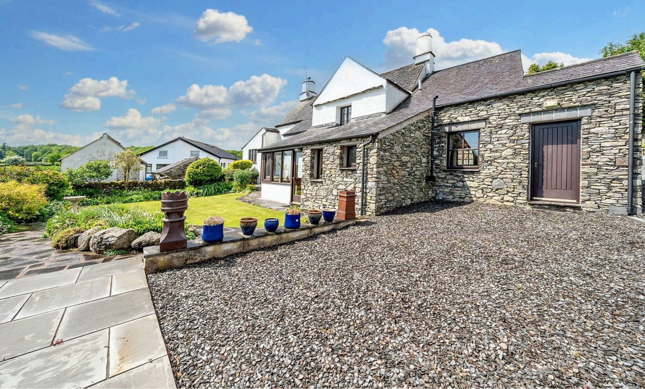
1 Fiddler Hall, Newby Bridge £550,000