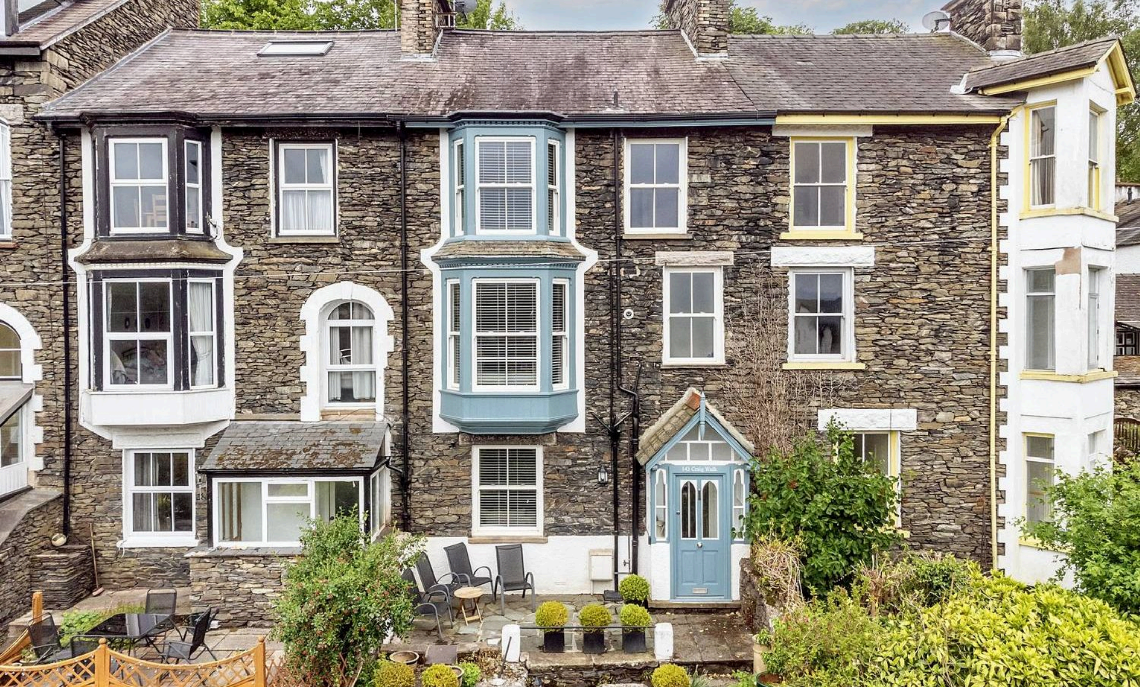
143 Craig Walk, Bowness-On-Windermere £397,500