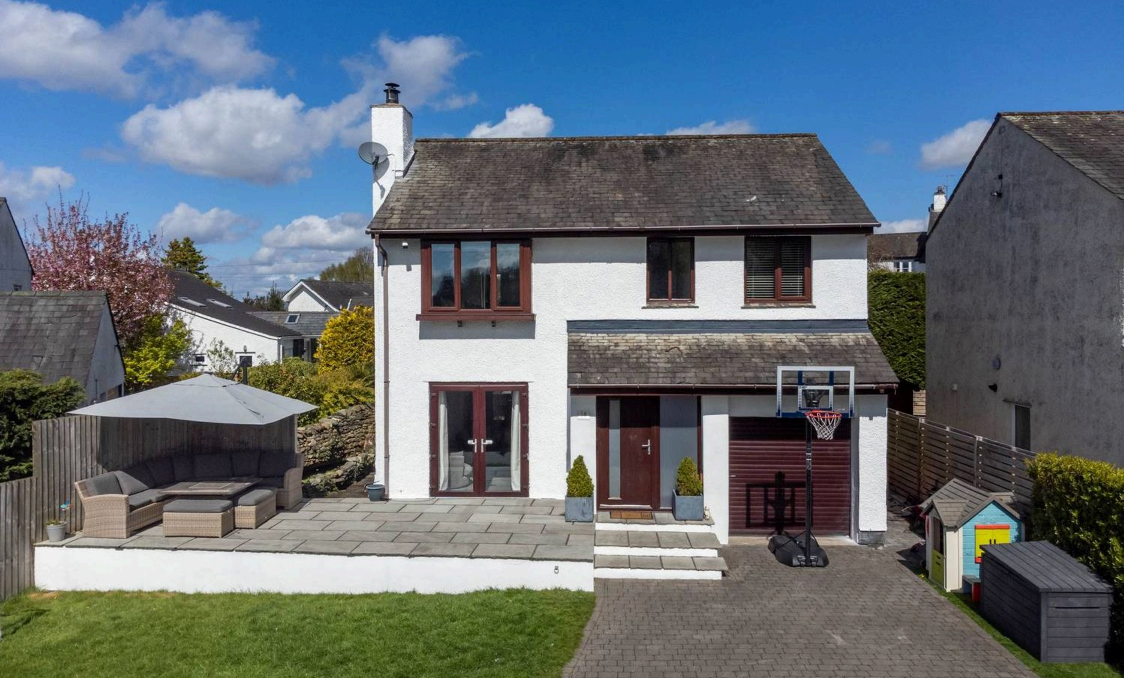
16 Fairfield, Bowness-On-Windermere £755,000