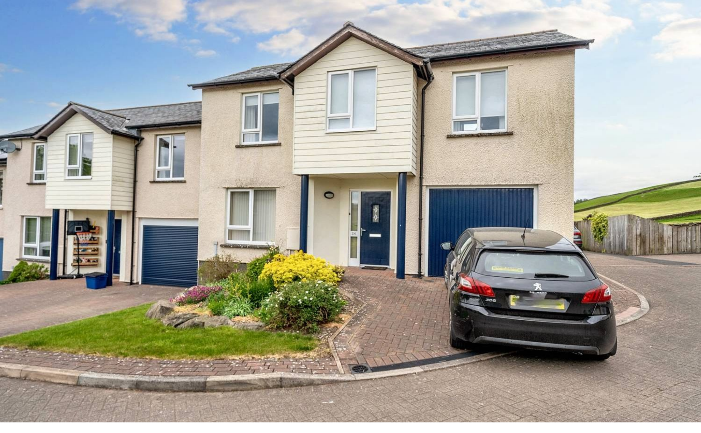
34 Low Cragg Close, Kendal £350,000