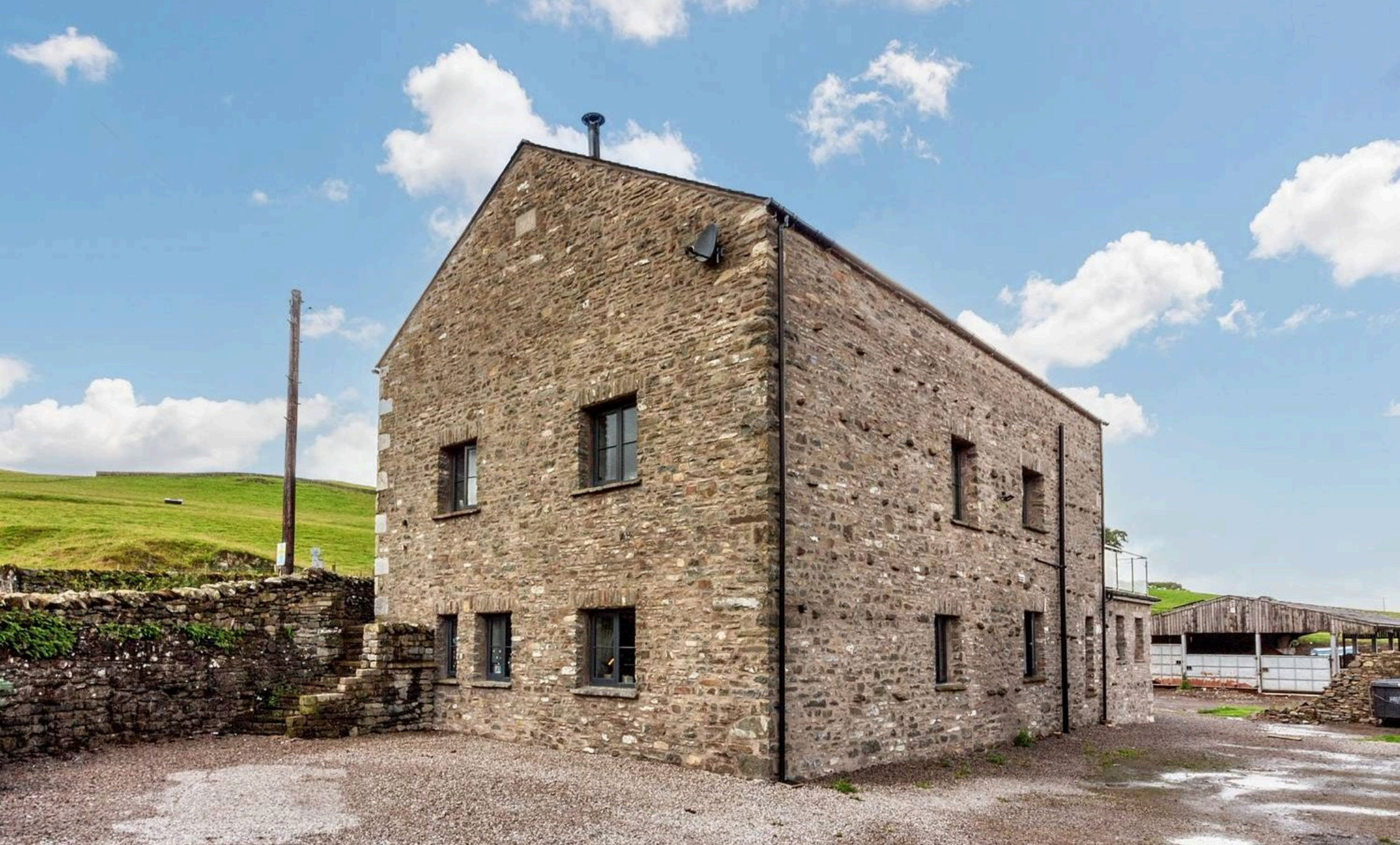
Barn View, Lambrigg £800,000