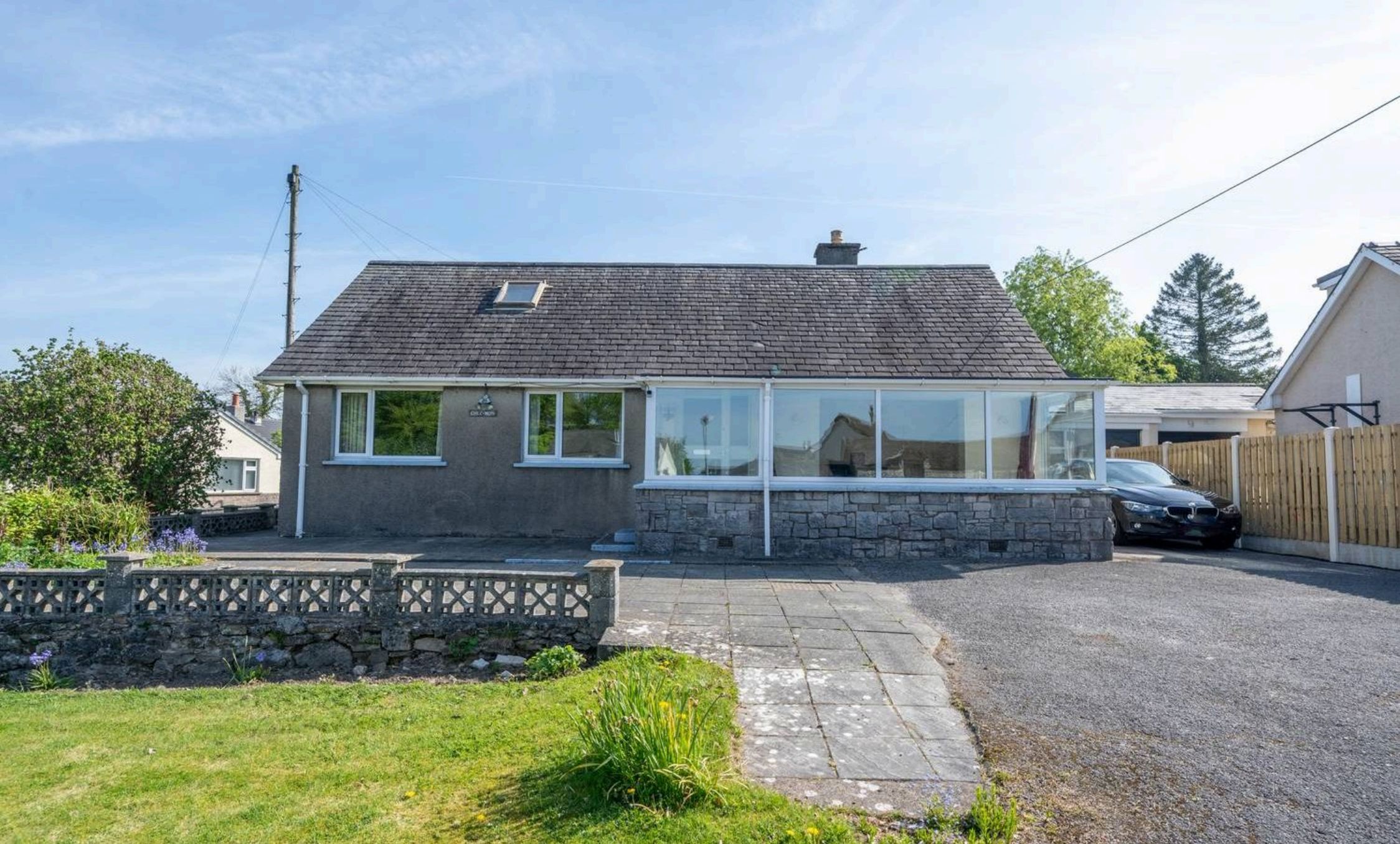
Chez Mon Burton Road, Holme £385,000