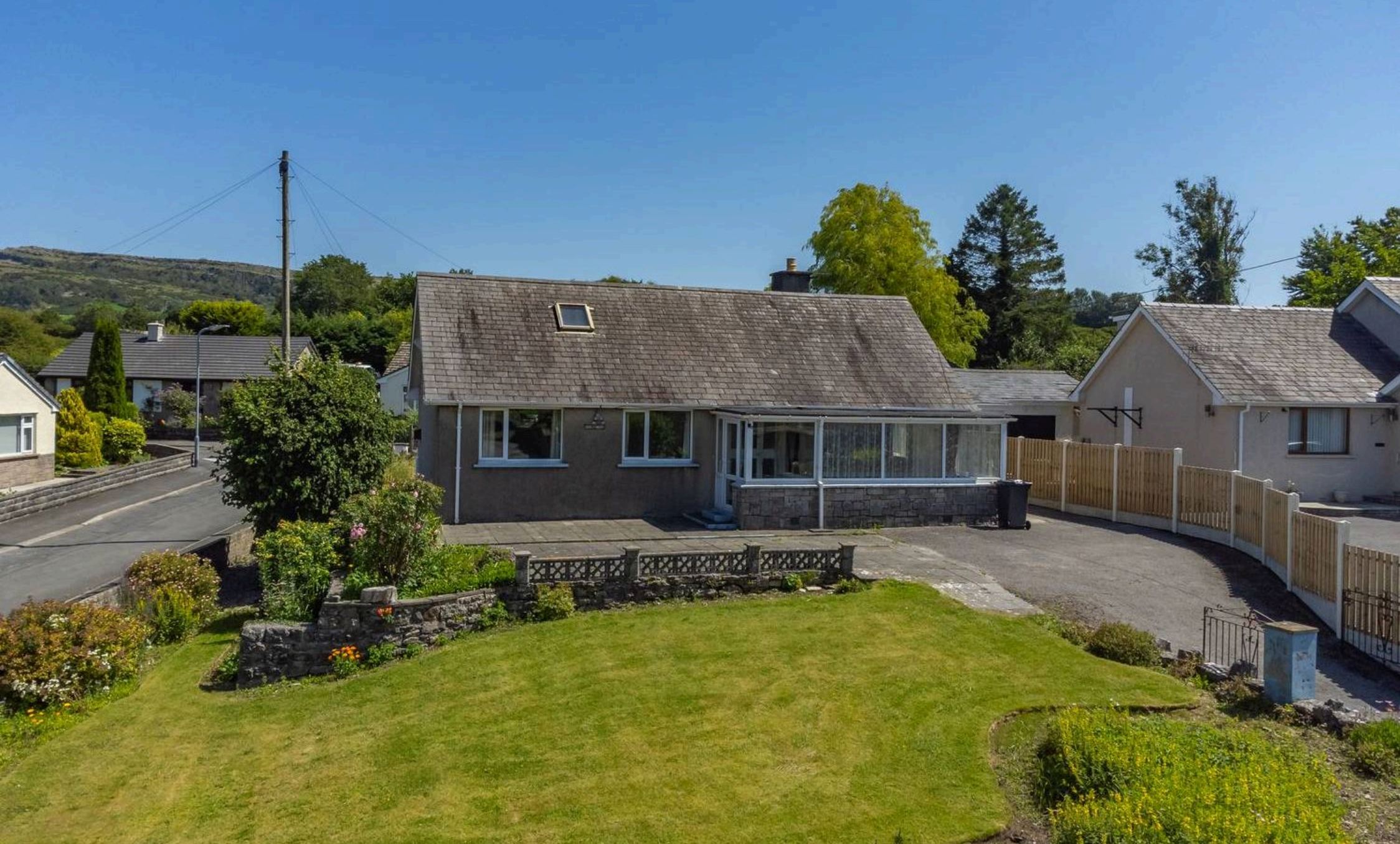
Chez Mon Burton Road, Holme £360,000