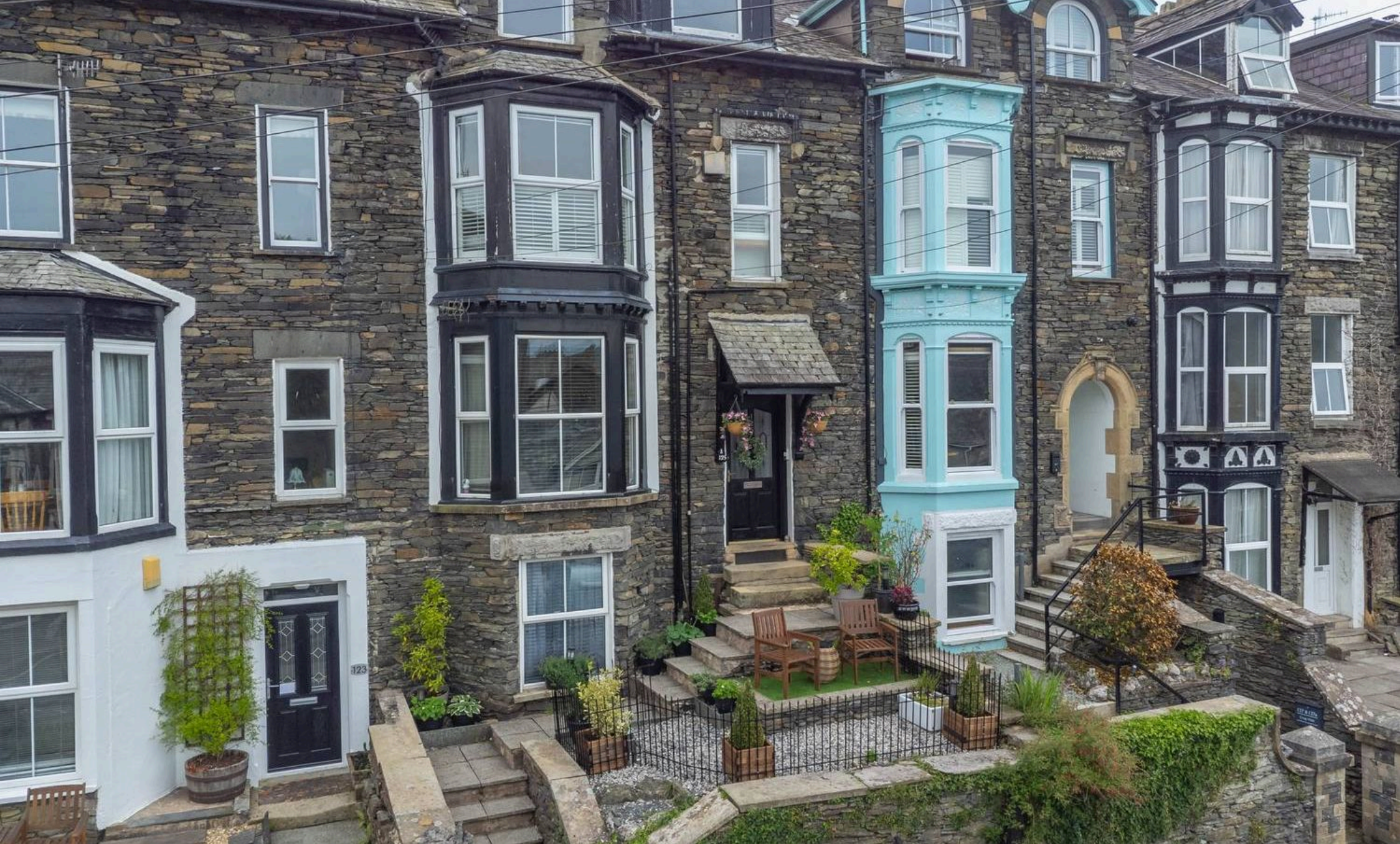
125 Craig Walk, Bowness-On-Windermere £250,000